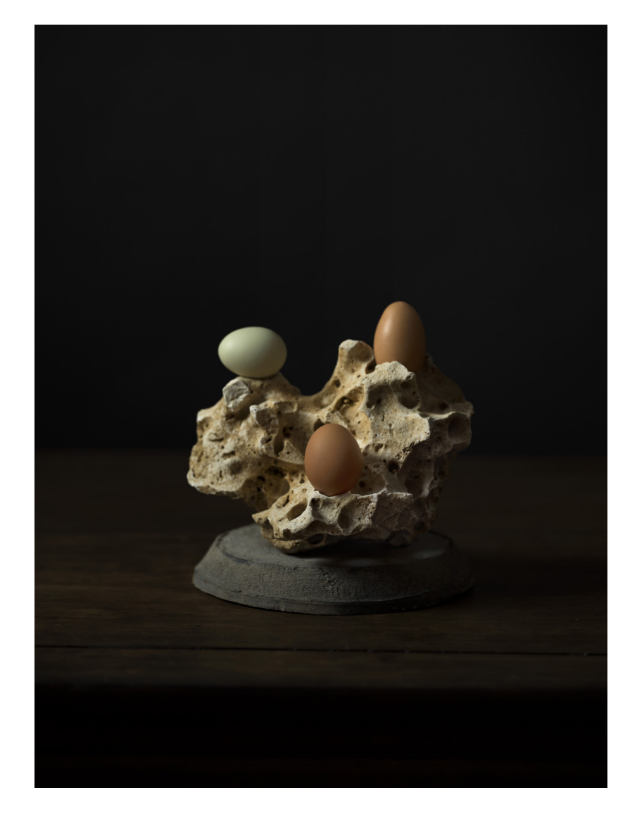
The Gift II (D01), 2020, archival pigment print, edition of 12, 22 × 17 inches