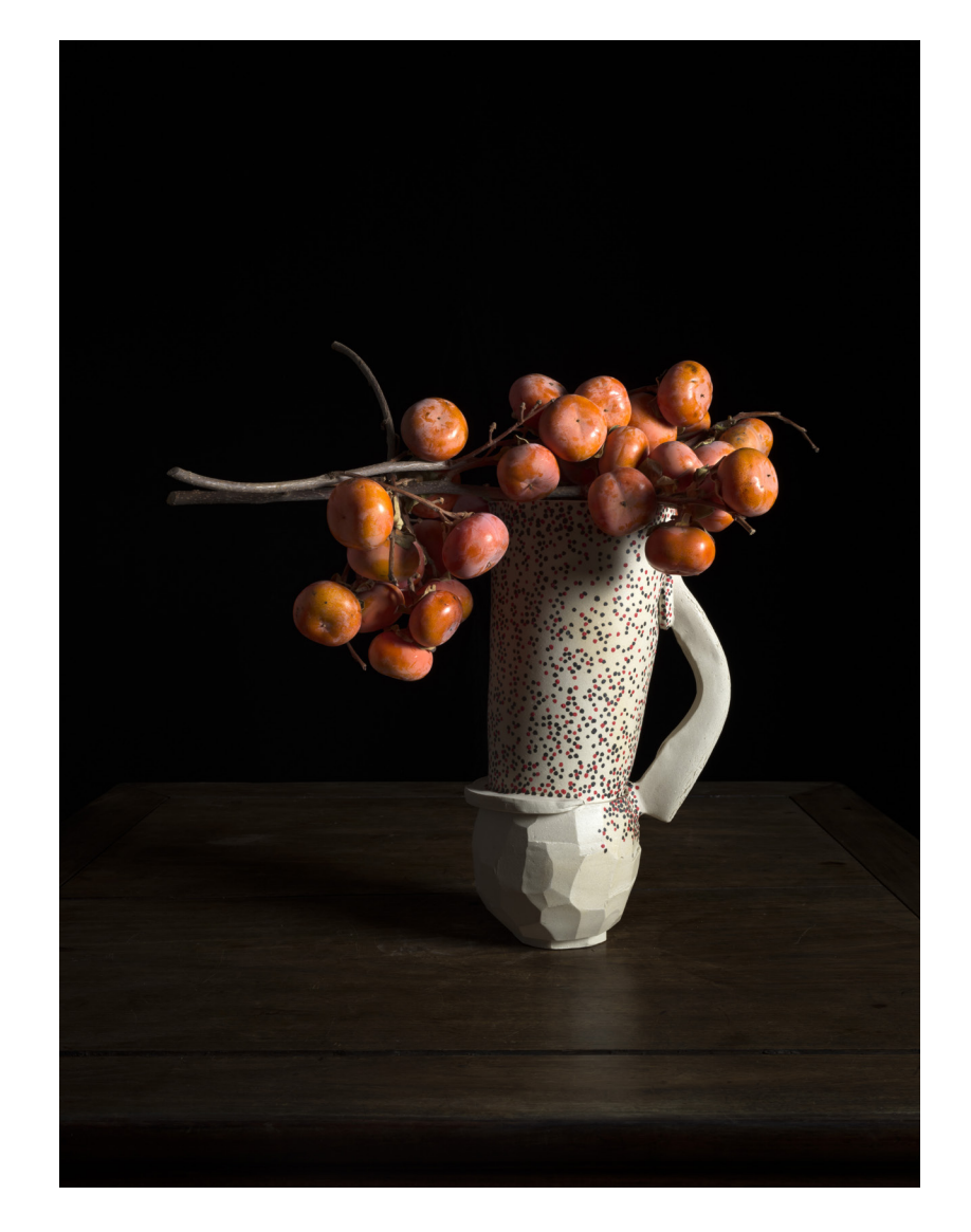
The Gift II (D09), 2021, archival pigment print, edition of 12, 22 \times 17 inches