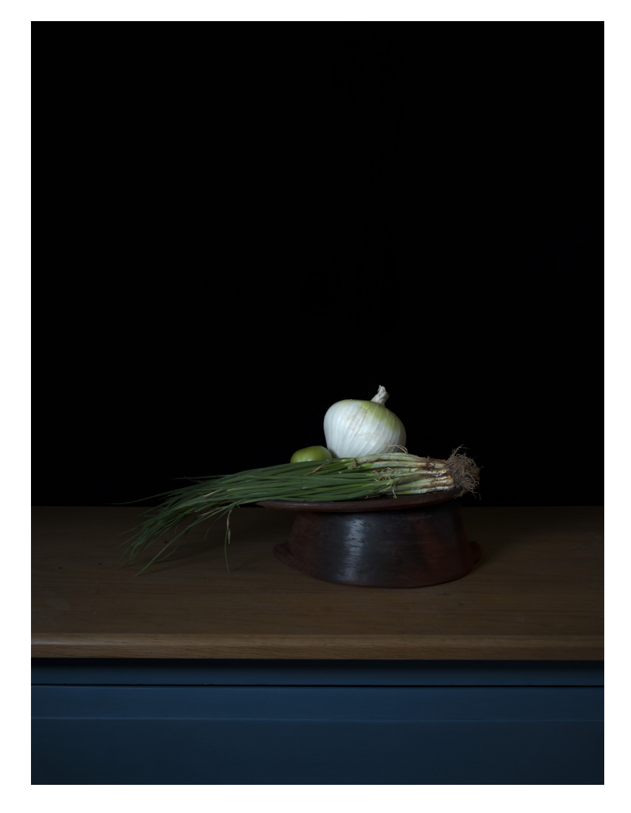
The Gift II (A01), 2021, archival pigment print, edition of 12, 22 × 17 inches