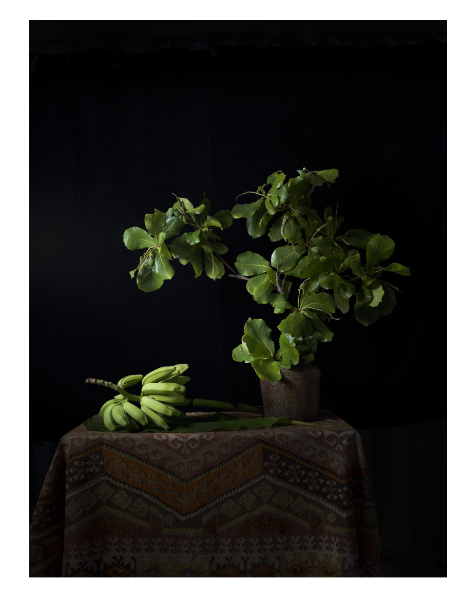
The Gift II (F01), 2021, archival pigment print, edition of 5, 48 x 36 inches

Han Feng's clothing, design, and art installations have been featured in major exhibitions at the Victoria and Albert Museum, London; Neue Galerie and Cooper-Hewitt National Design Museum, New York, among others.