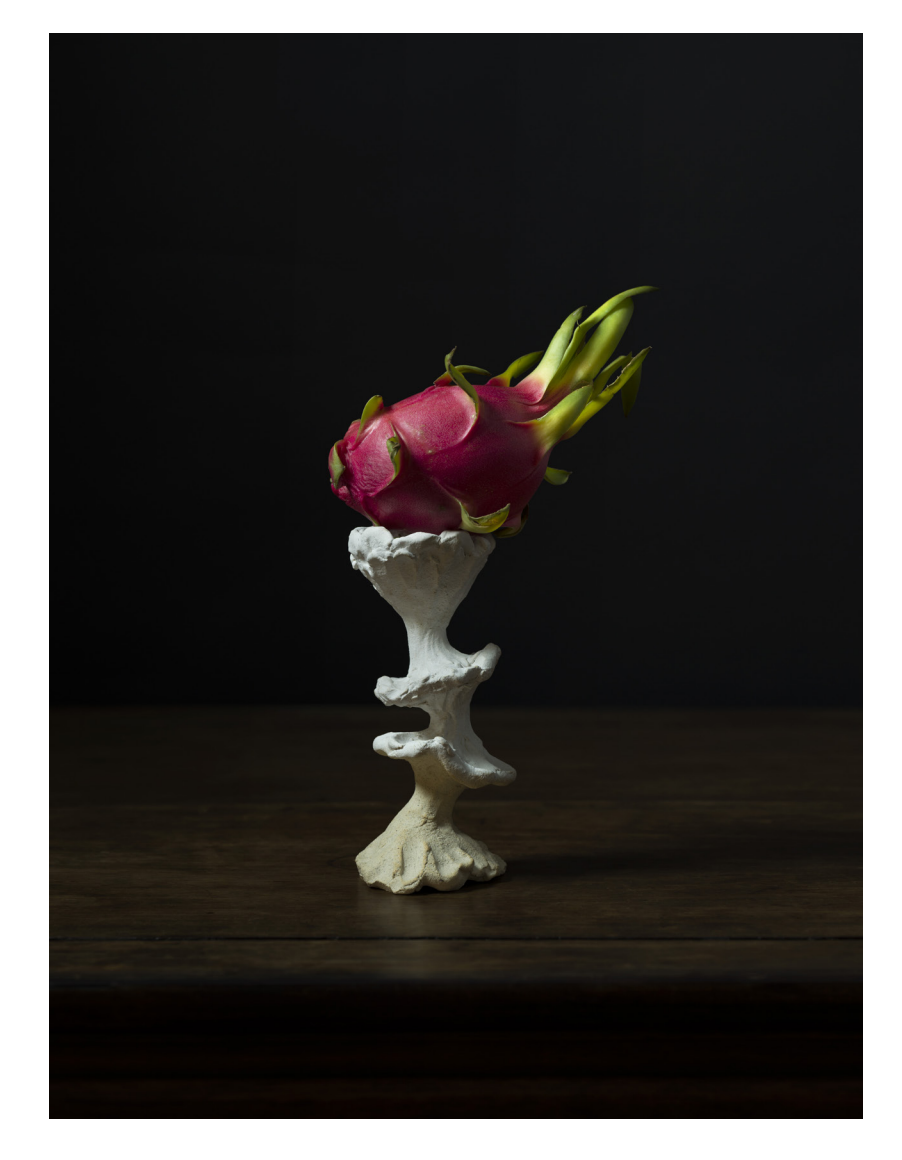
The Gift II (D06), 2020, archival pigment print, edition of I2, 22 × I7 inches