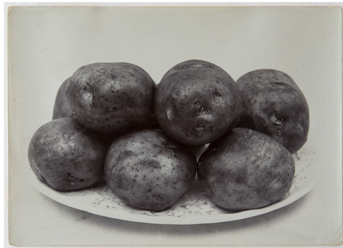
Potato Red Round , c. 1900, vintage gold-toned gelatin silver print, 4 1/4 x 6" $8,000