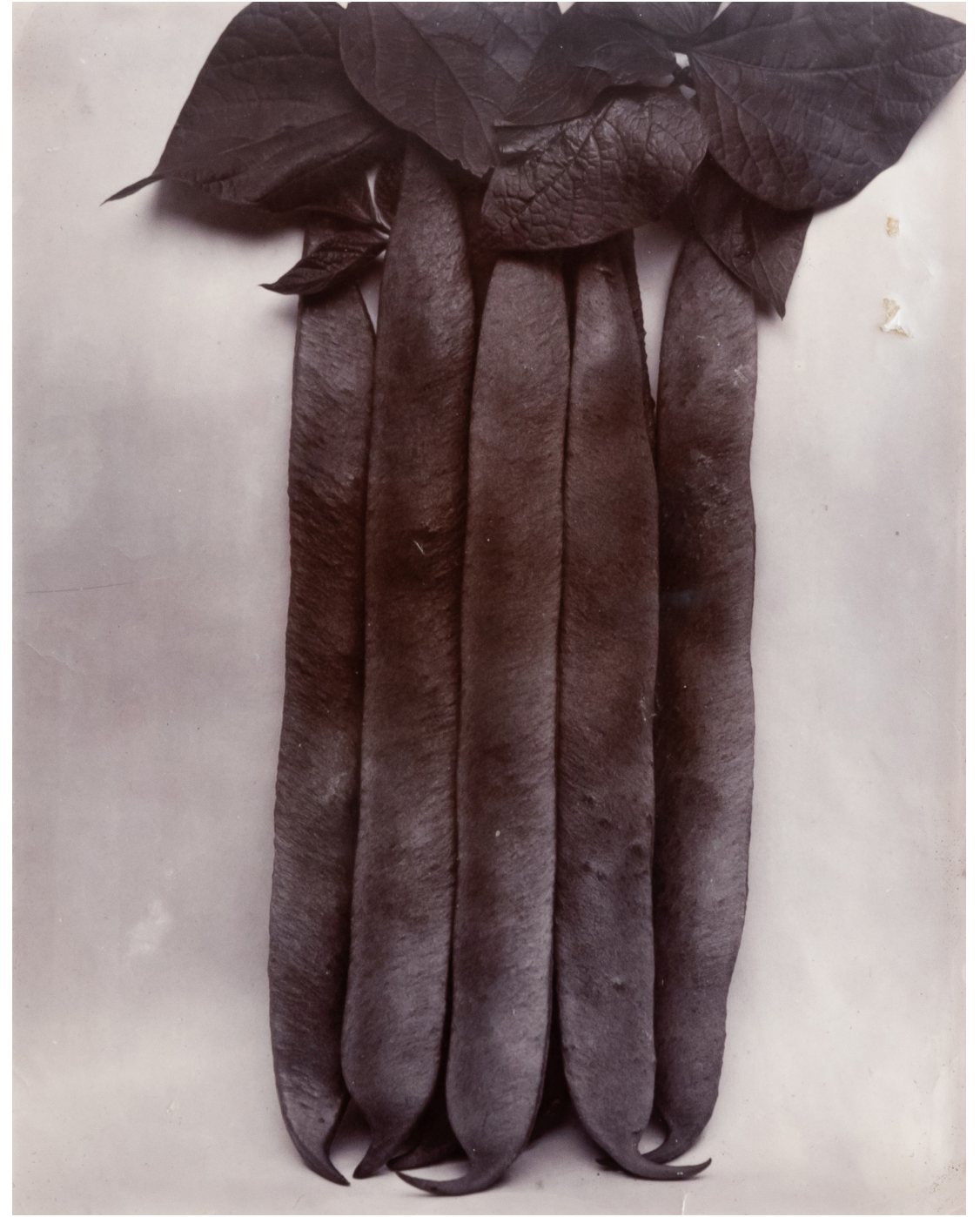
Beans, c. 1900, vintage gold-toned gelatin silver print, 9 \frac{5}{8} x 7 \frac{3}{4} " $12,000