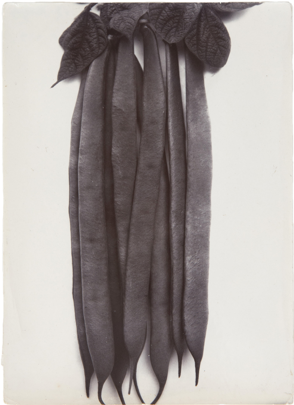
Bean (Dwarf) Sutton's Masterpiece , c. 1900 vintage gold-toned gelatin silver print, 6 x 4 1/4" $8,000