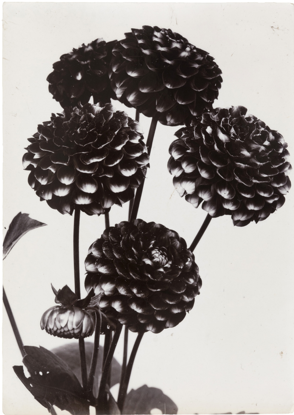
Pompon Dahlia "Tommy Keith" , c. 1900, vintage gold-toned gelatin silver print, 6 x 4 1/4" $8,000