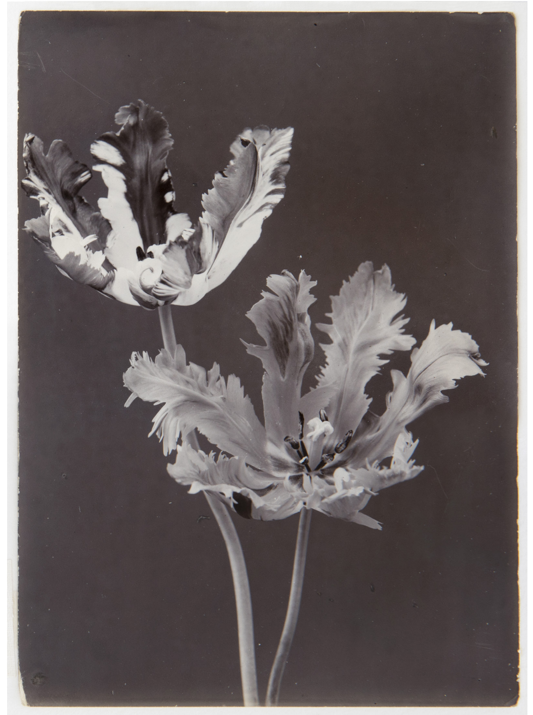
Parrot Tulips , c. 1900, vintage gold-toned gelatin silver print, 6 x 4 \frac{1}{4} " $8,000