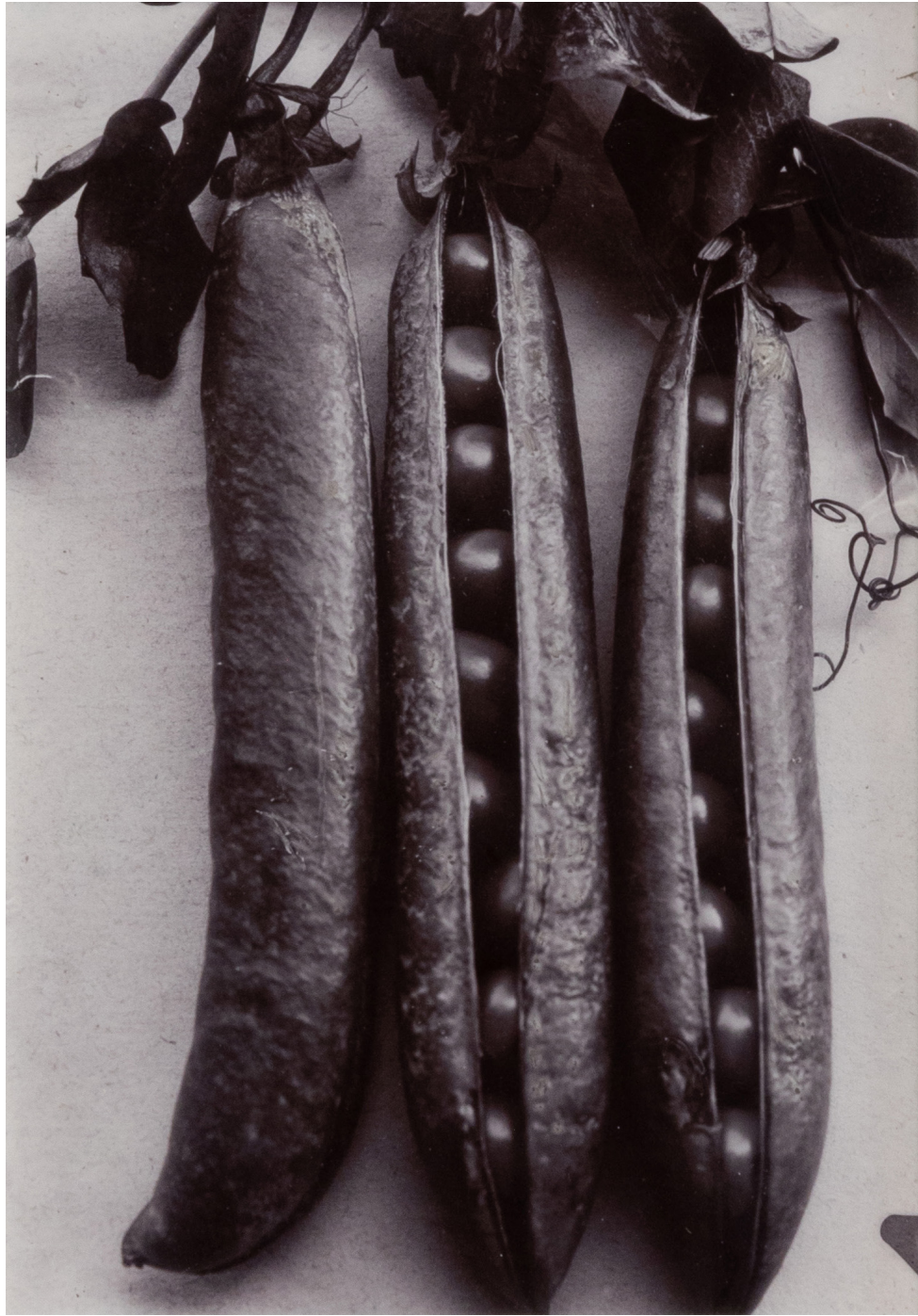
Beans/Peas, c. 1900, vintage gold-toned gelatin silver print, 6 \frac{1}{2} x 4 \frac{1}{4} " $8,000