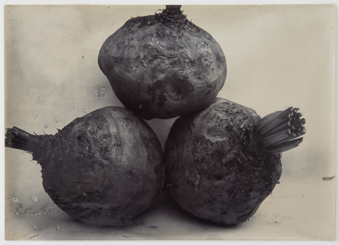
Mangold Yellow Globe , c. 1900, vintage gold-toned gelatin silver print, 4 \frac{1}{4} x 6" $8,000