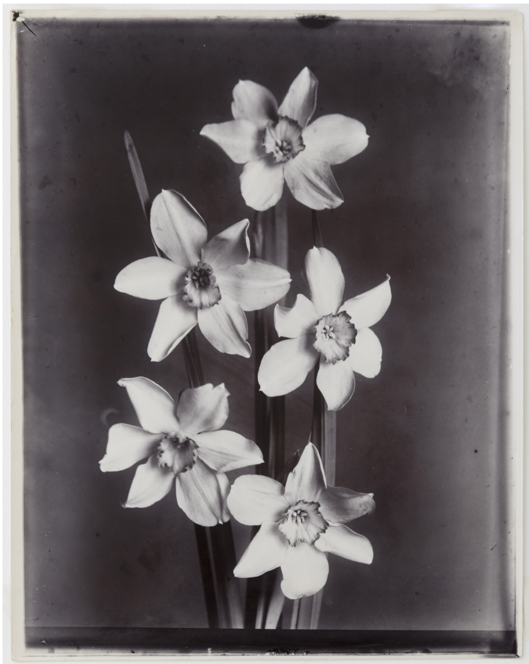
Narcissus Incomparabilis Barri , c. 1900, vintage gold-toned gelatin silver print, 10 × 8" $11,000