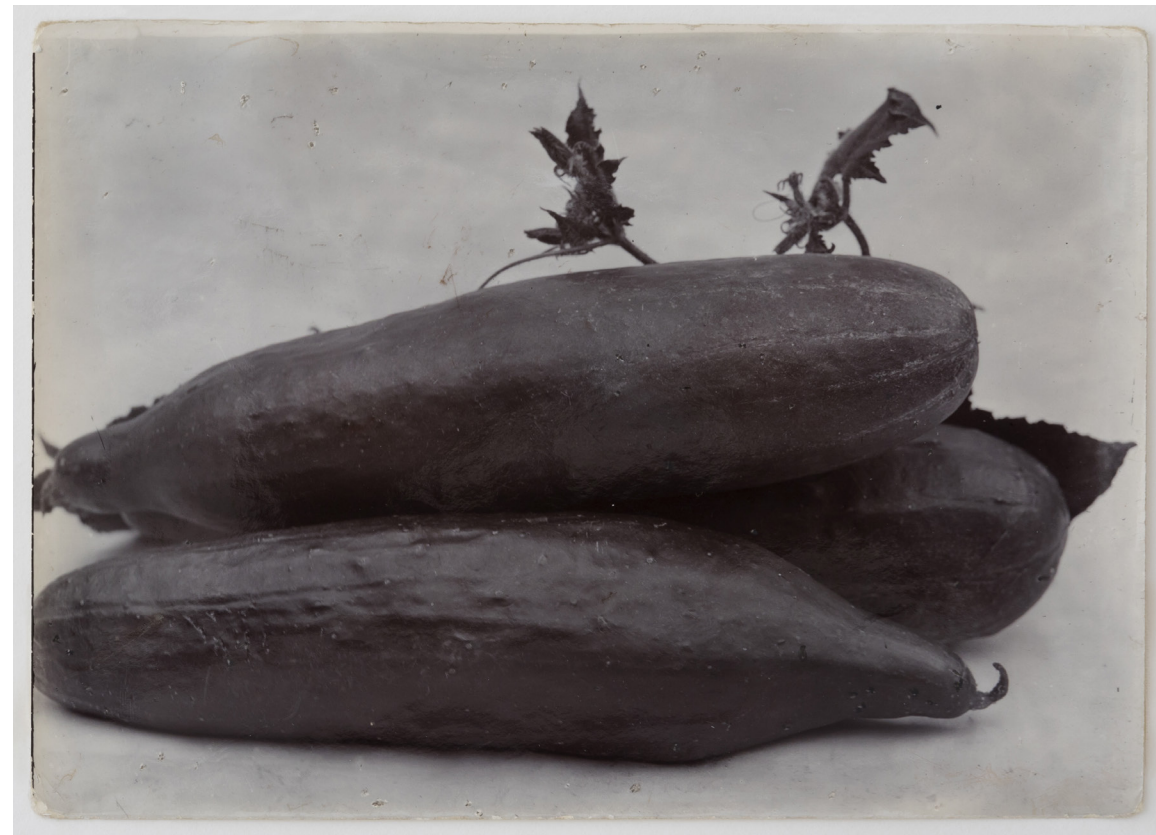
Ridge Cucumber , c. 1900, vintage gold-toned gelatin silver print, 4 1/4 x 6" $8,000