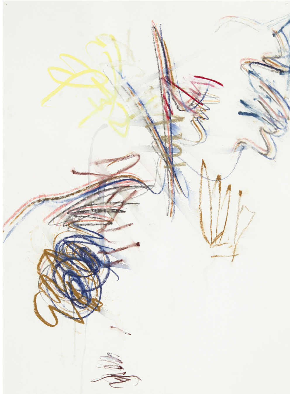
Untitled (cm.20.20) , 2020, crayon, colored pencil on paper, 30 x 22 inches