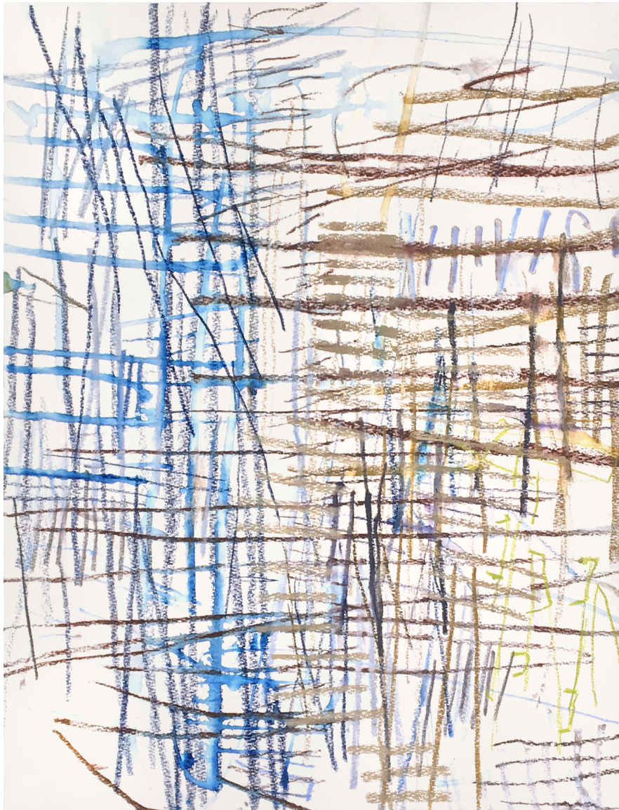
Untitled (cg.18.4), 2018, pastel, pencil, crayon, conté on paper, 20 x 15 inches