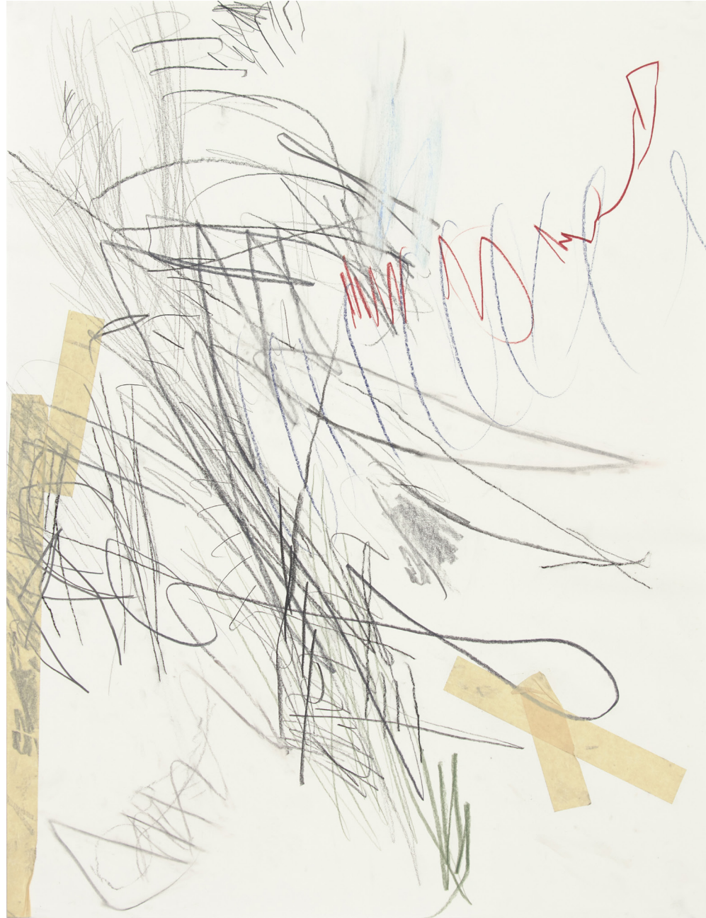
Untitled (cm.19.12) , 2019, crayon, graphite, colored pencil, tape on paper, 23 1/2 x 18 inches