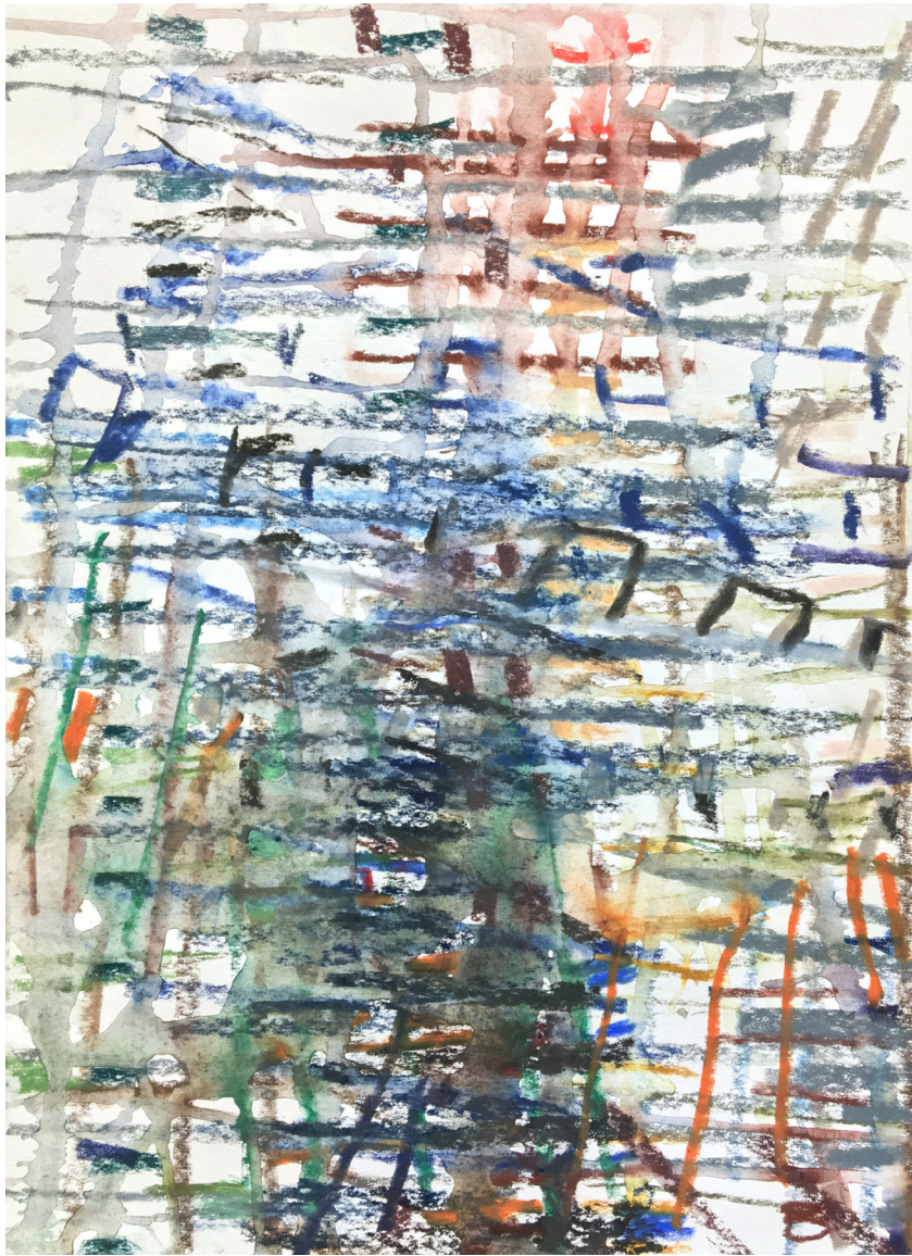
Untitled (cg.18.10) , 2018, pastel, pencil, crayon, conté on paper, 17 x 14 inches