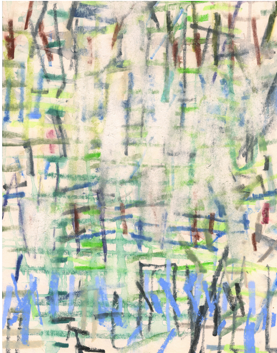
Untitled (cg.21.17) , 2021, pastel, crayon on paper, 11 5 / 8 x 9 inches