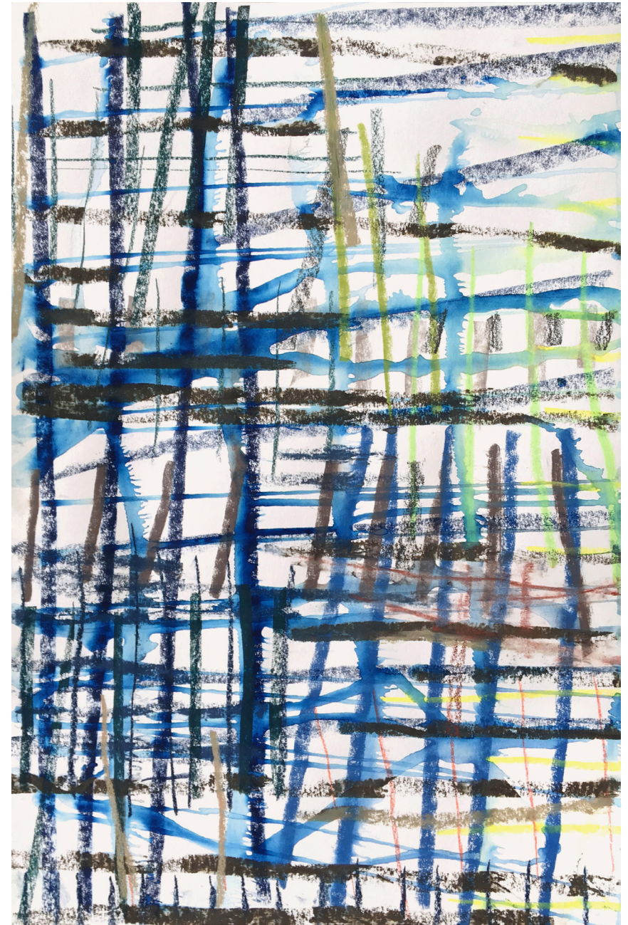
Untitled (cg.17.4) , 2017, pastel, pencil, crayon, conté on paper, 20 x 13 inches