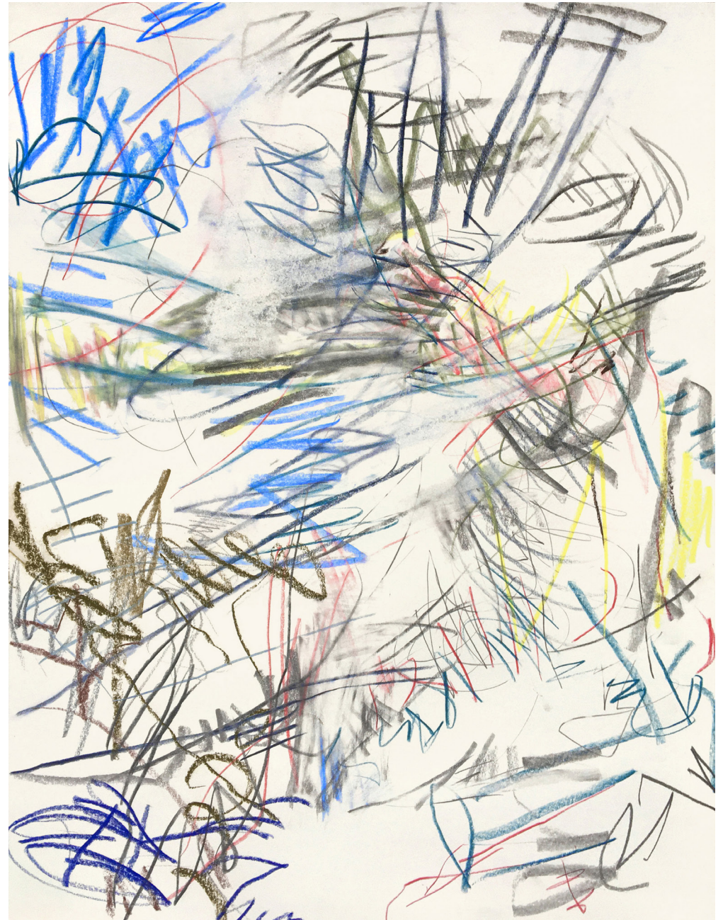
Untitled (cm.19.11) , 2019, crayon, color pencil, graphite on paper, 23 1/2 x 18 inches