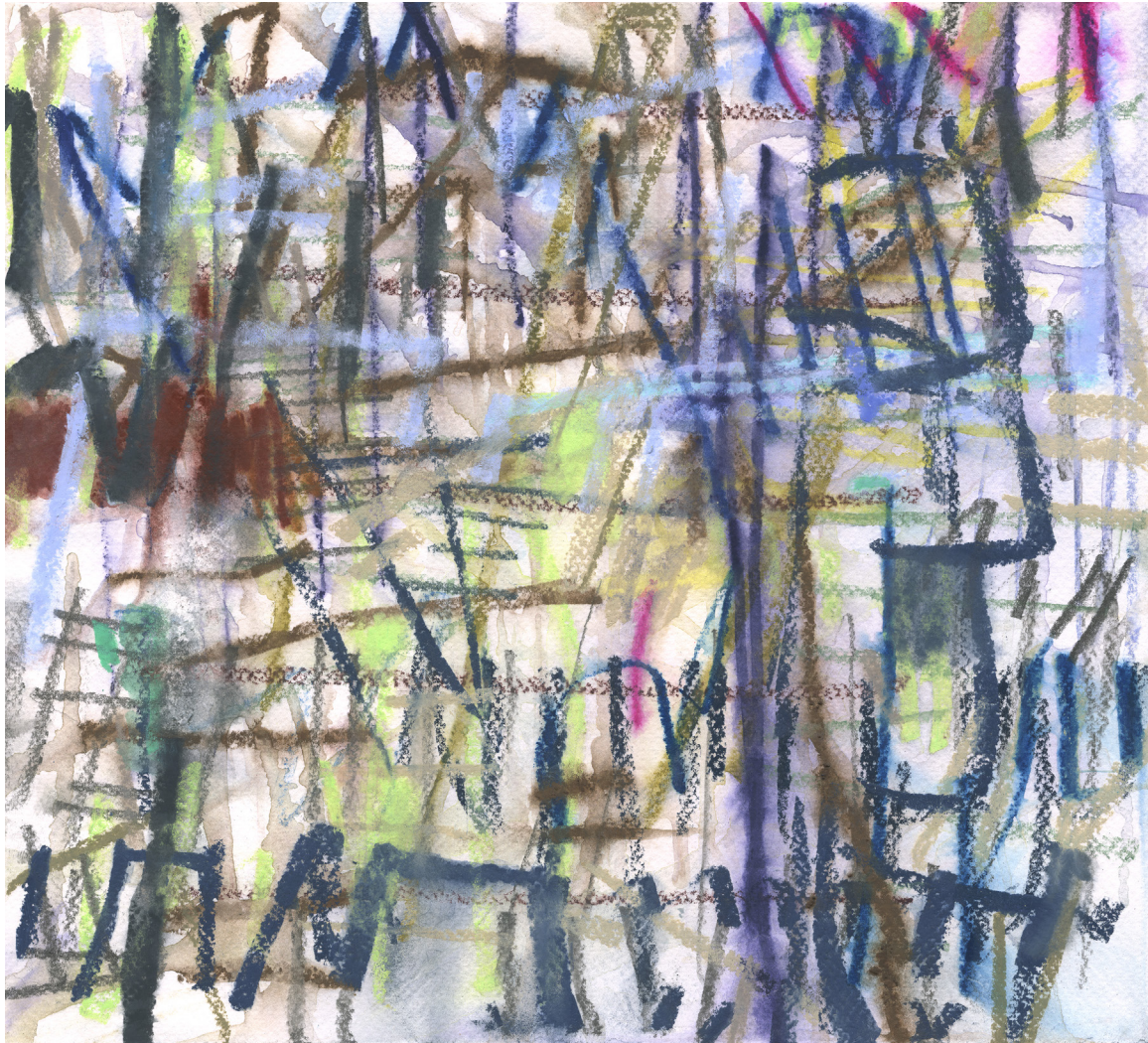
Untitled (cg.20.2) , 2020, crayon, pastel on paper, 11 1/4 x 12 1/4 inches