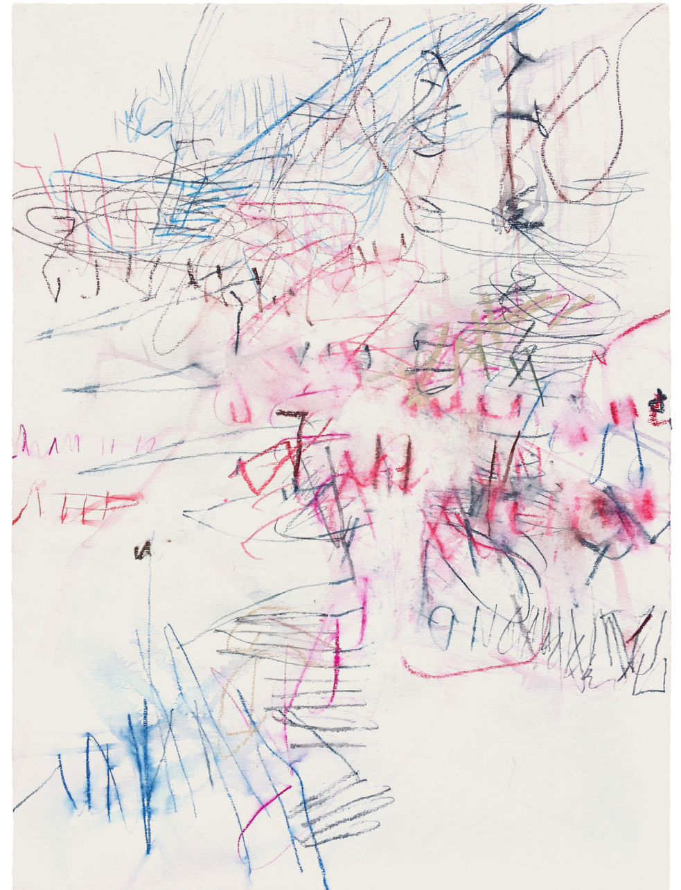
Untitled (cm.21.12) , 2021, crayon, pastel, colored pencil on paper, 30 x 22 inches