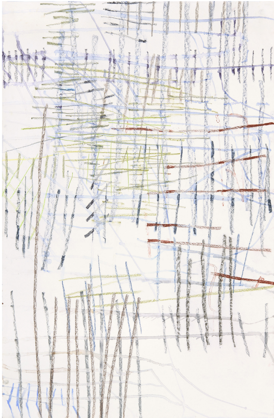
Untitled (cg.20.25) , 2020, crayon, pastel on paper, 40 x 26 inches