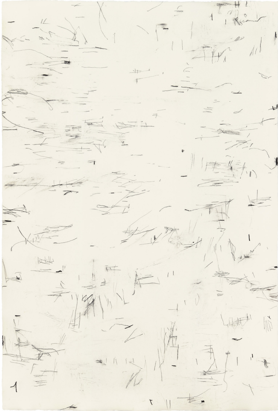
Untitled (chg.21.2), 2021, charcoal on paper, 47 3 / 4 x 32 inches