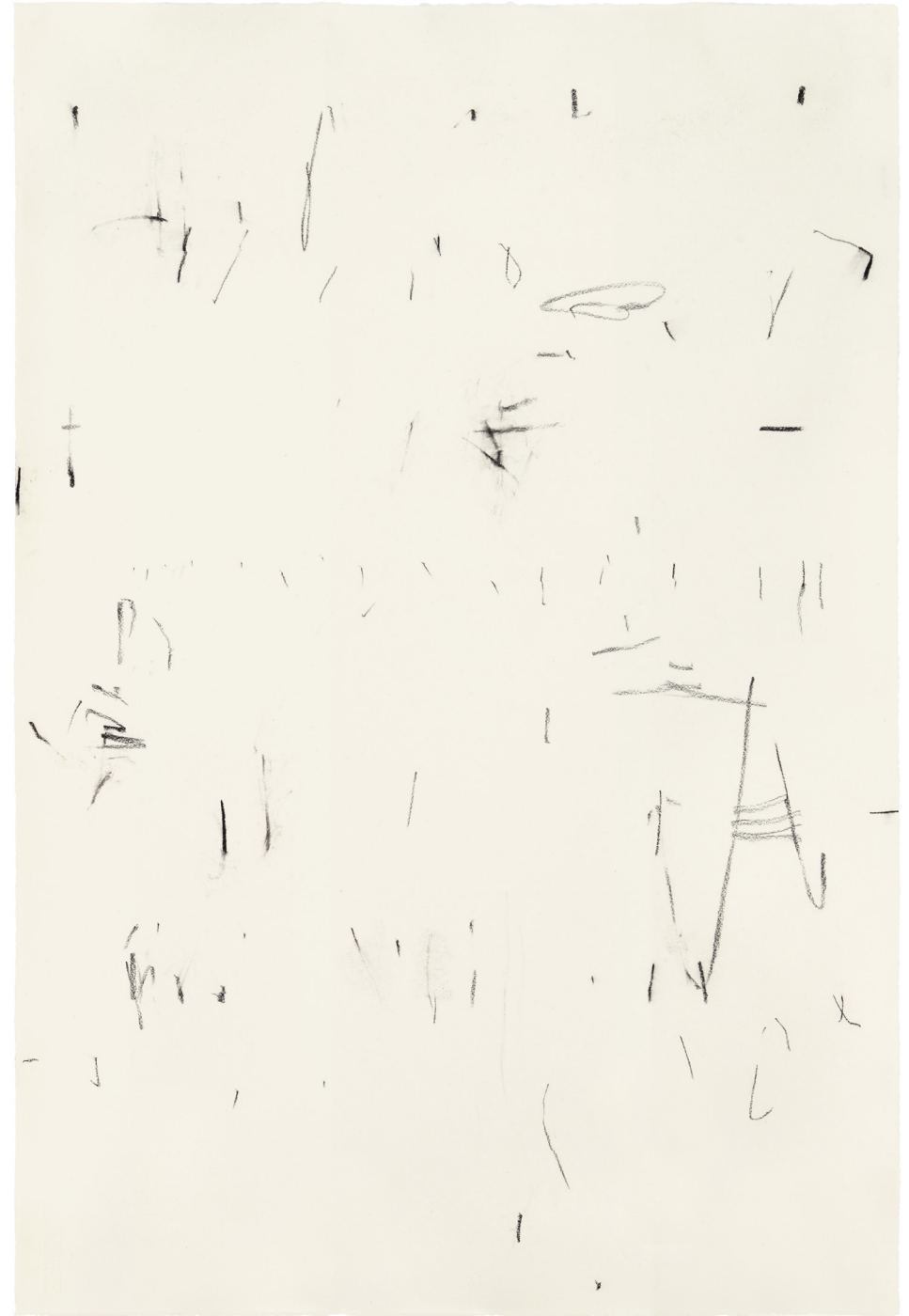
Untitled (chg.21.3), 2021, charcoal on paper, 47 3 / 4 x 32 inches