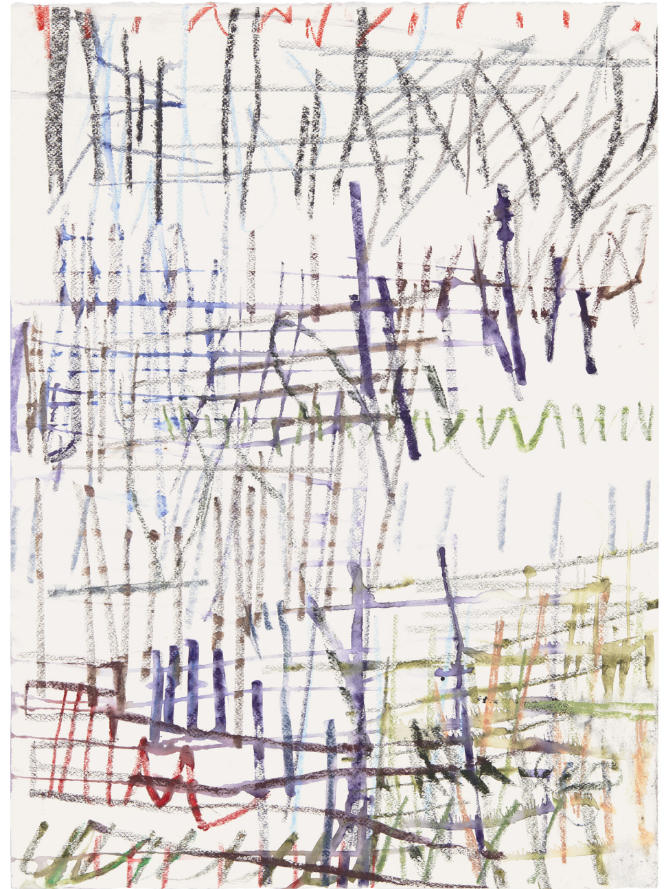
Untitled (cg.18.21) , 2018, crayon, colored pencil, pastel on paper, 30 x 22 inches