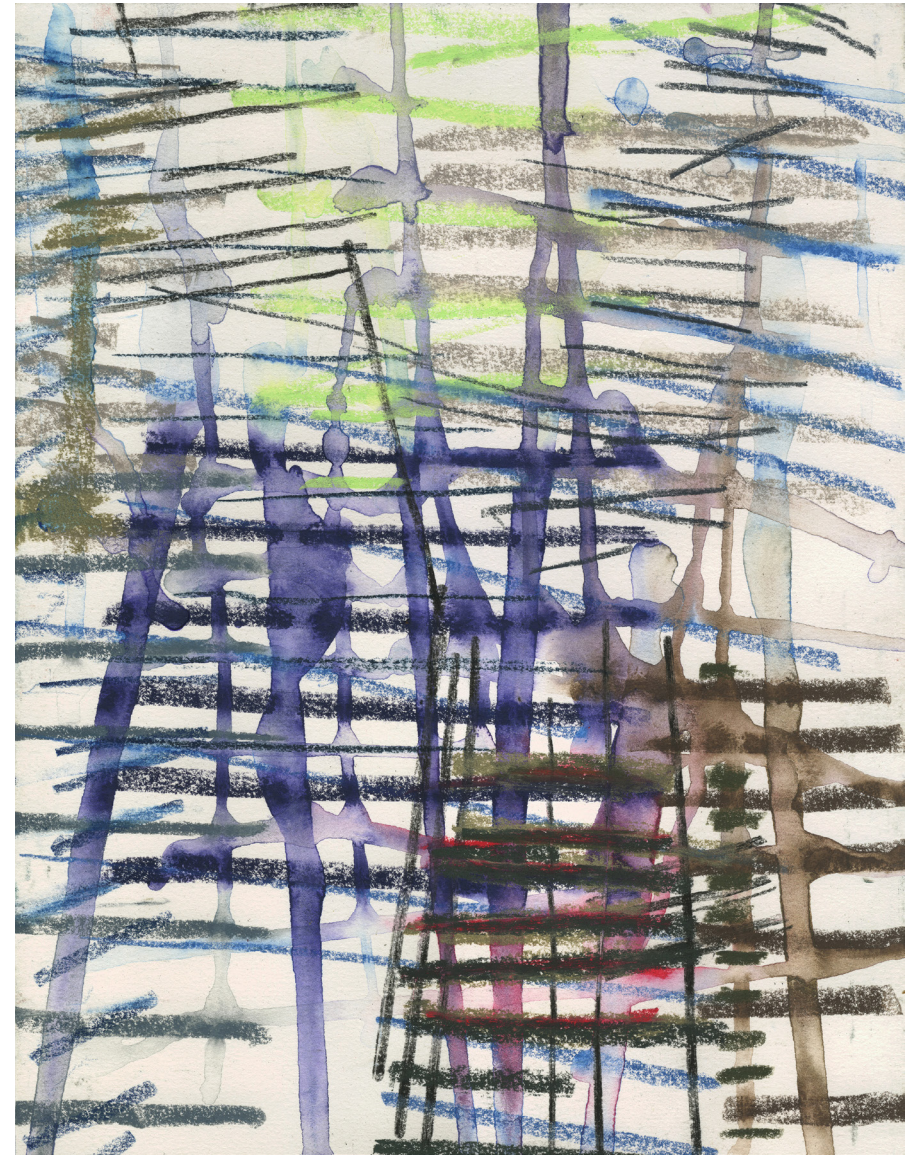
Untitled (cg.17.2) , 2017, pastel, crayon on paper, 11 7 / 8 x 9 inches