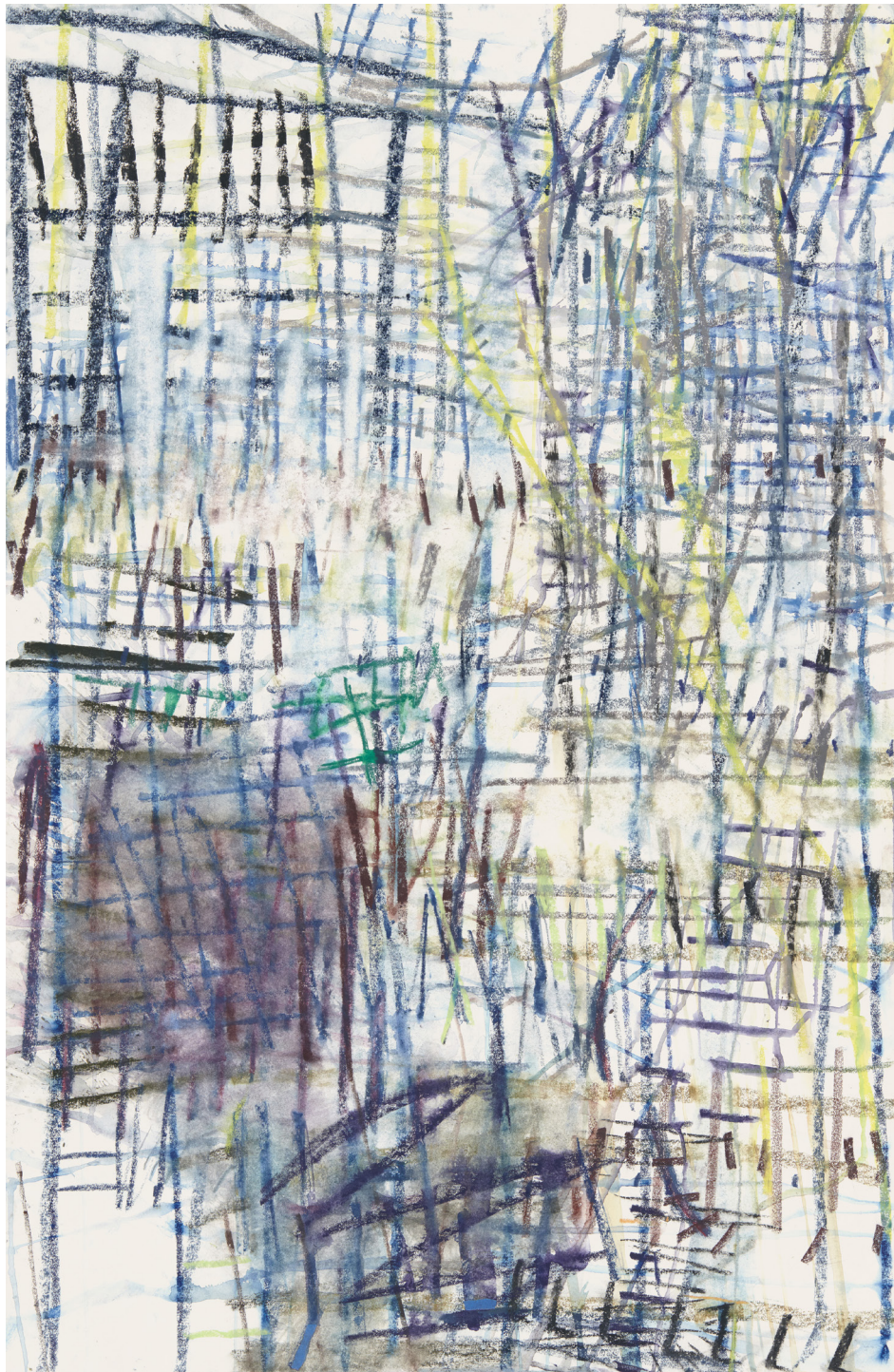
Untitled (cg.18.20) , 2018, crayon, pastel, blue tape on paper, 40 x 26 inches