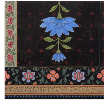
Blooming At Night , 2022, gouache, 16 1/4 x 16 1/4"

From November 3 through December 22, 2022, Victoria Munroe Fine Art is proud to present Festivities and Meditation , paintings and textiles by Antonia Munroe. On view together for the first time, Munroe's distinct bodies of work - gouache paintings and hand dyed and stenciled tapestries - are contrasted in this engaging installation. The intimate scale and power of the flower paintings draw one close while the ambition of the ornate linen tapestries hold decorative composition to a unique standard. Her imaginative use of botanical sources and her inventive practice with repeating patterns are at the heart of Munroe's sensibility.