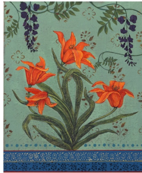
Dancing in Step , 2022 gouache, 18 1/4 x 15 1/4"