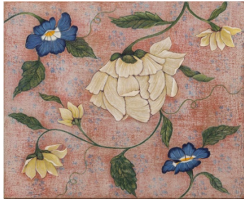
Above is Sky , 2022, gouache, 12 x 14 1/4"

67 E 80 TH STREET #2 NEW YORK NY 10075 917.900.6661 victoriamunroefineart.com