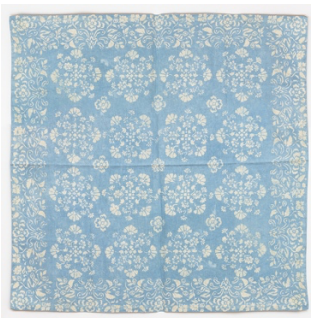
Indigo Tapestry , 2021, hand dyed, printed on linen 52 x 51"

"Each of my paintings presents an imaginary flowering plant. I place an open blossom on a vine of leafy choreography illustrating the bloom cycle. Or, a pendant blue flower hovers in dark space, each petal outlined in gold paint, a characteristic of the Pichhwai technique."