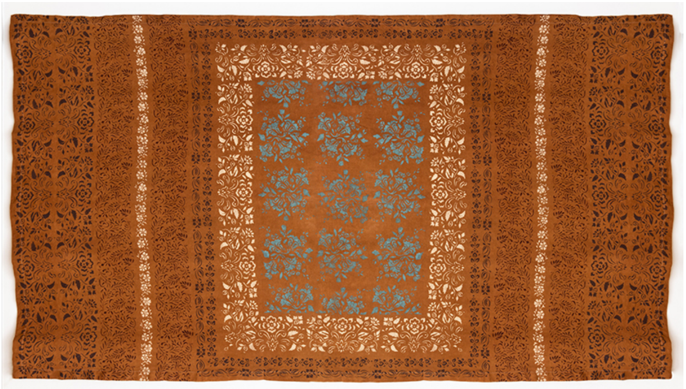
Antonia Munroe Cutch Tapestry , 2022 hand dyed and printed on linen 62 x 110 inches SOLD