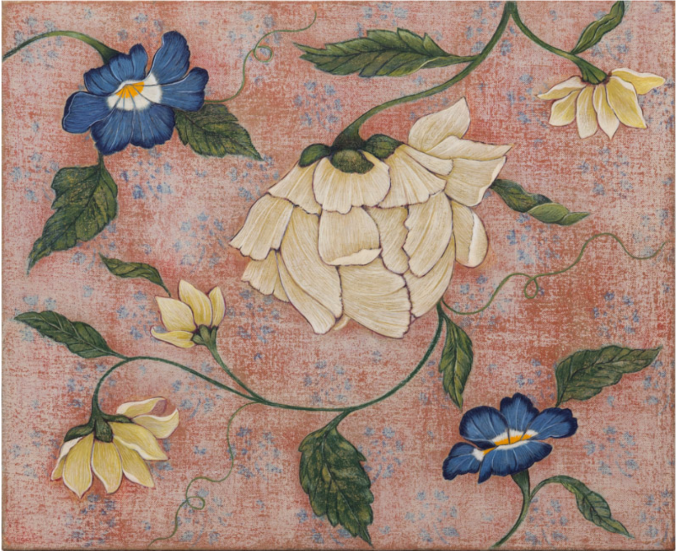
Antonia Munroe Above is Sky , 2022 gouache on linen on panel 12 x 14 1/4 inches SOLD