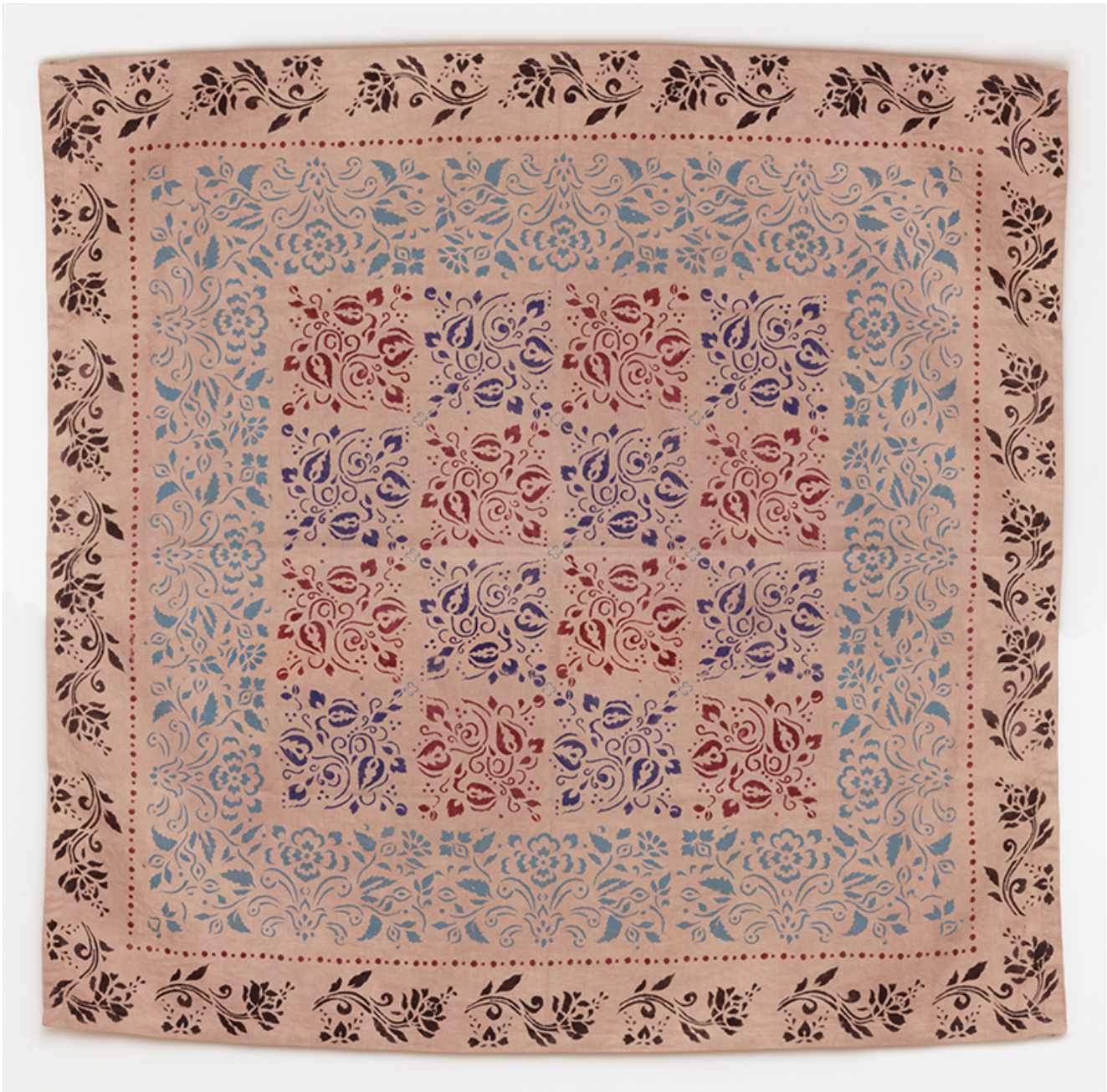
Antonia Munroe Lac Tapestry II , 2021 hand dyed and printed on linen 50 x 52 inches $2,000