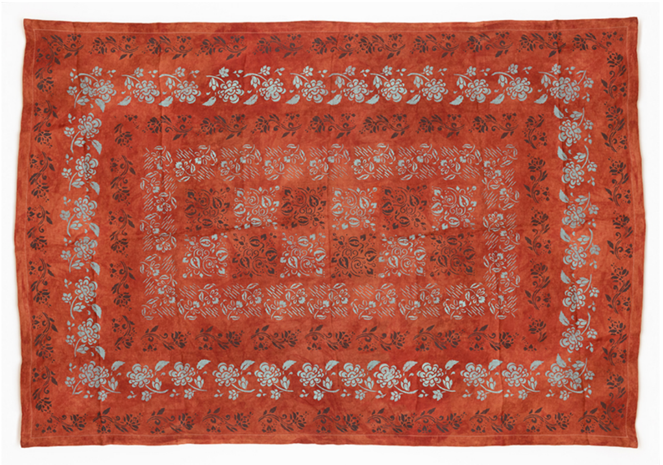
Antonia Munroe Madder Tapestry , 2022 hand dyed and printed on linen 63 x 92 inches SOLD