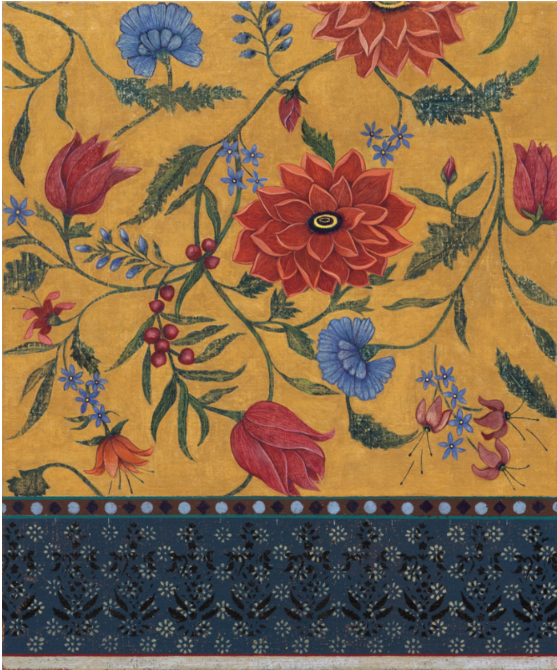
Antonia Munroe Abundantly Blooming Vine , 2022 gouache on linen on panel 18 1/4 x 15 1/4 inches $8,500