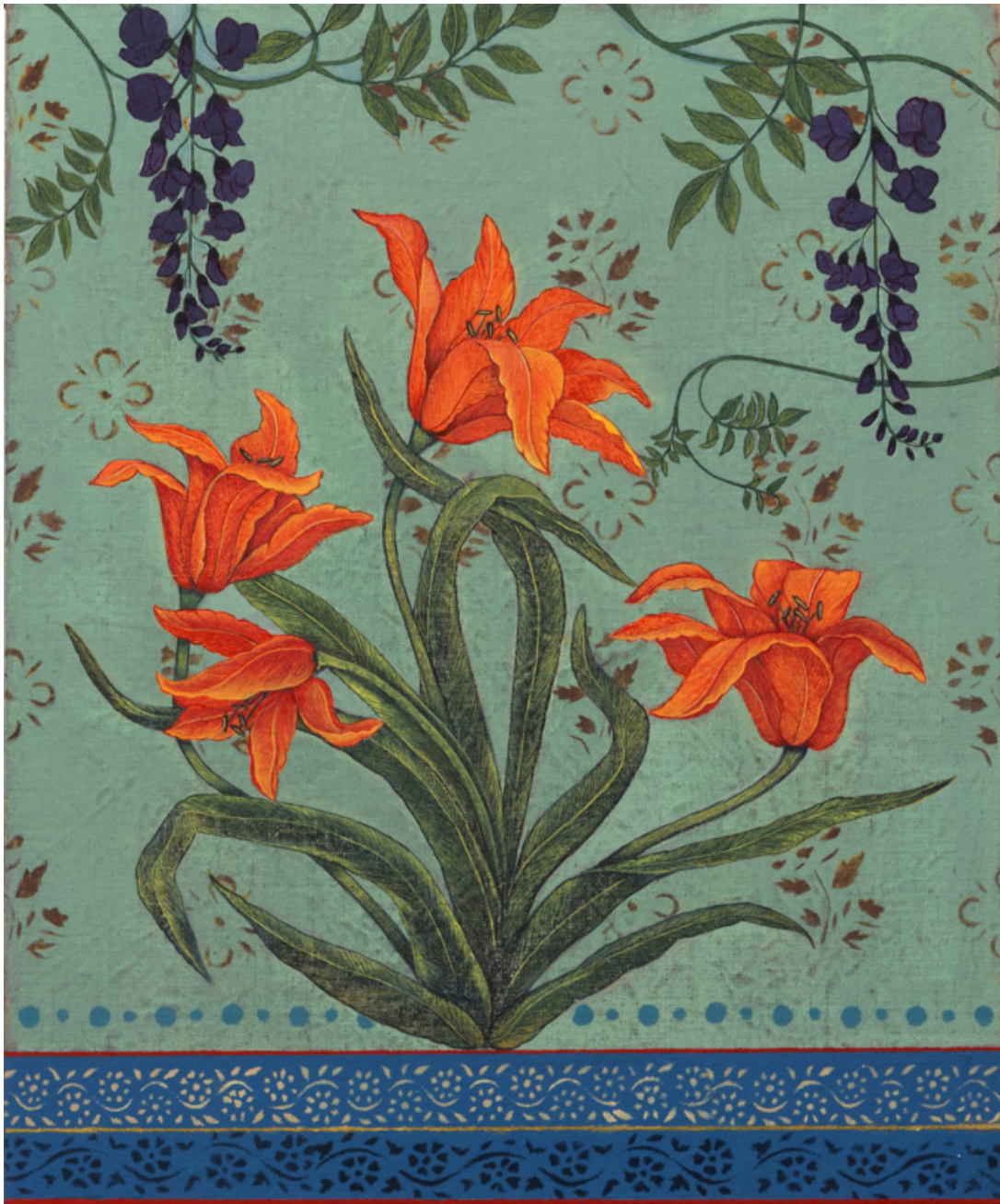
Antonia Munroe Dancing in Step , 2022 gouache on linen on panel 18 1/4 x 15 1/4 inches $8,500