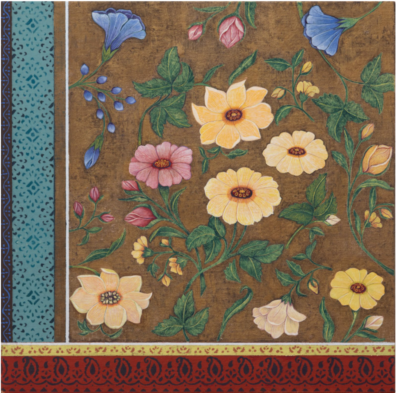
Antonia Munroe Divinely They Danced , 2022 gouache on linen on panel 16 1/4 x 16 1/4 inches SOLD