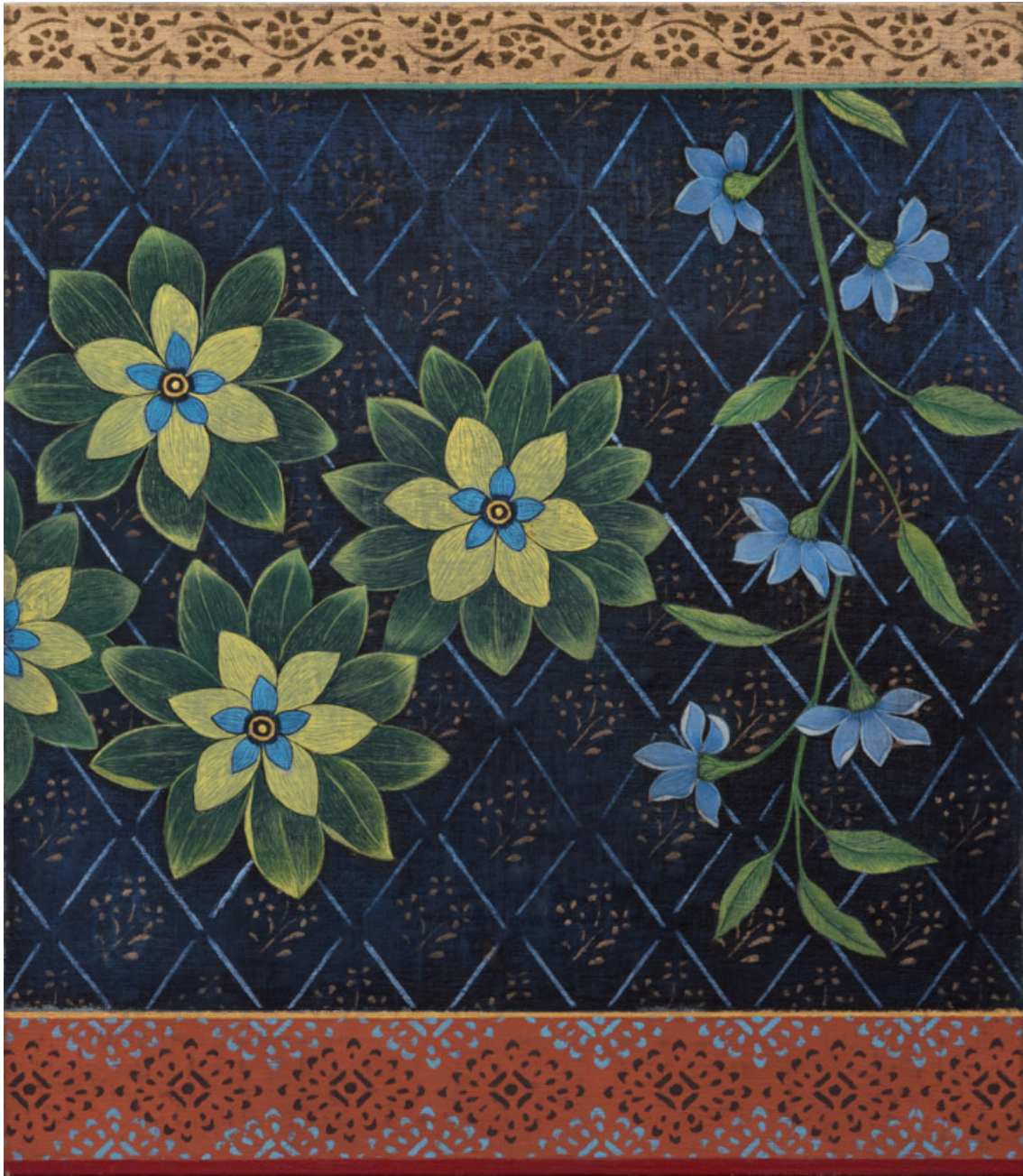
Antonia Munroe Gracing the Night , 2022 gouache on linen on panel 16 1/4 x 14 1/4 inches $8,500