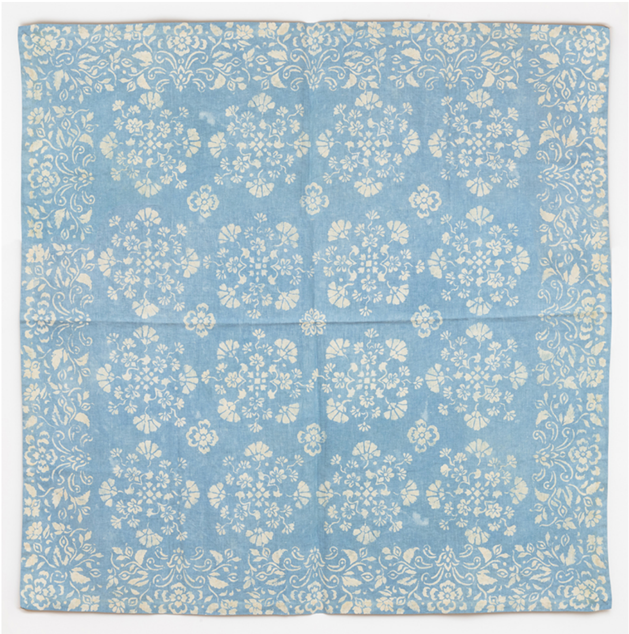
Antonia Munroe Indigo Tapestry , 2021 hand dyed and printed on linen 52 x 51 inches SOLD