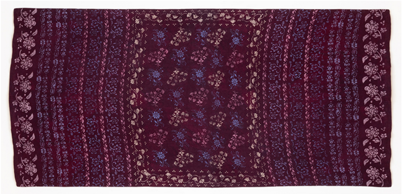
Antonia Munroe Java Plum Tapestry , 2022 hand dyed and printed on linen 52 x 106 inches SOLD