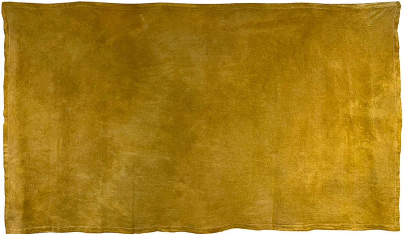
Antonia Munroe Marigold Tapestry , 2022 hand dyed on linen 62 x 112 inches $2,800