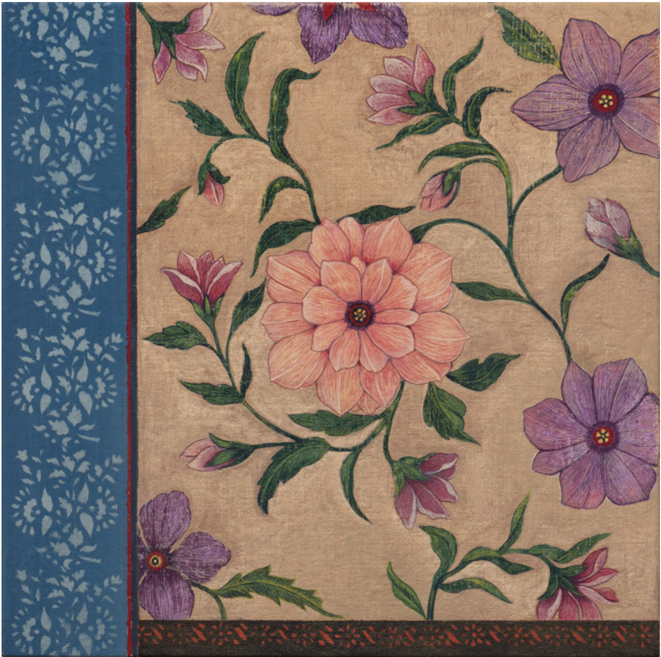
Antonia Munroe Festivities and Meditation: Three , 2022 gouache on linen on panel 12 x 12 inches $6,500