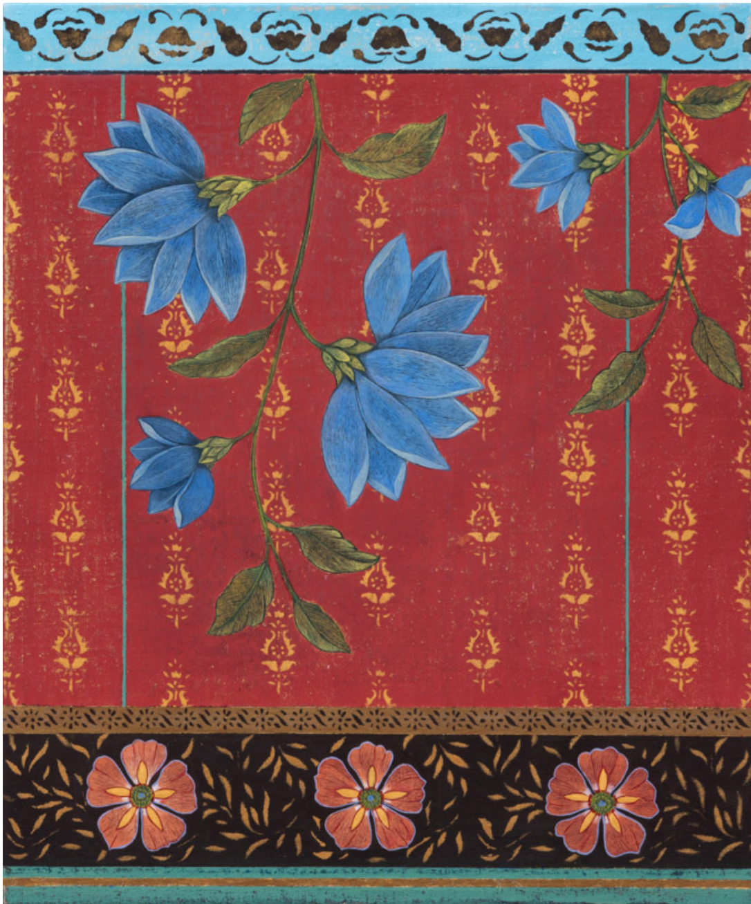
Antonia Munroe Under Trees of Gold , 2022 gouache on linen on panel 18 1/4 x 15 1/4 inches $8,500