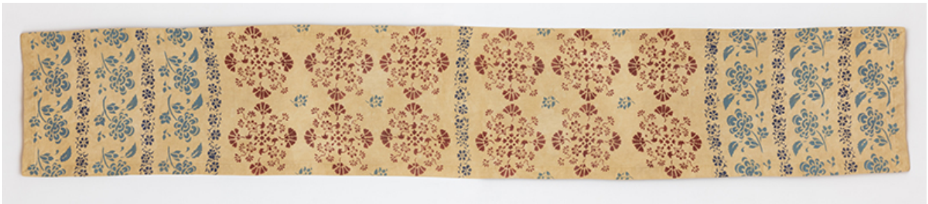
Antonia Munroe Myrobalan Runner I , 2021 hand dyed and printed on linen 19 x 108 inches $2,000