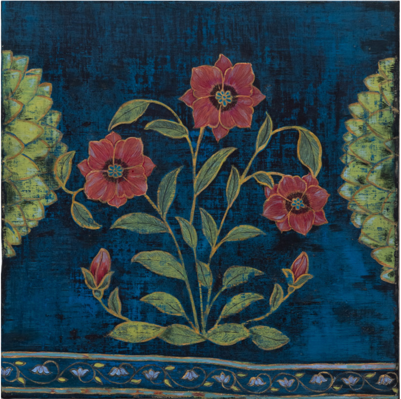
Antonia Munroe A Small Flowering Plant: green leaves , 2021 gouache on linen on panel 12 x 12 inches $6,500