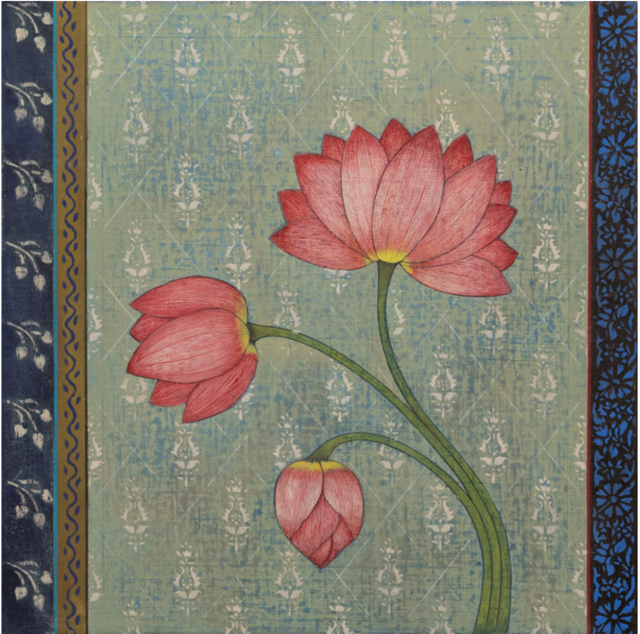
Antonia Munroe Resplendent Gazing , 2022 gouache on linen on panel 16 1/4 x 16 1/4 inches $8,500