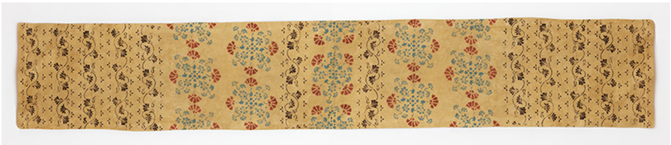
Antonia Munroe Myrobalan Runner II , 2021 hand dyed and printed on linen 19 x 116 inches $2,000