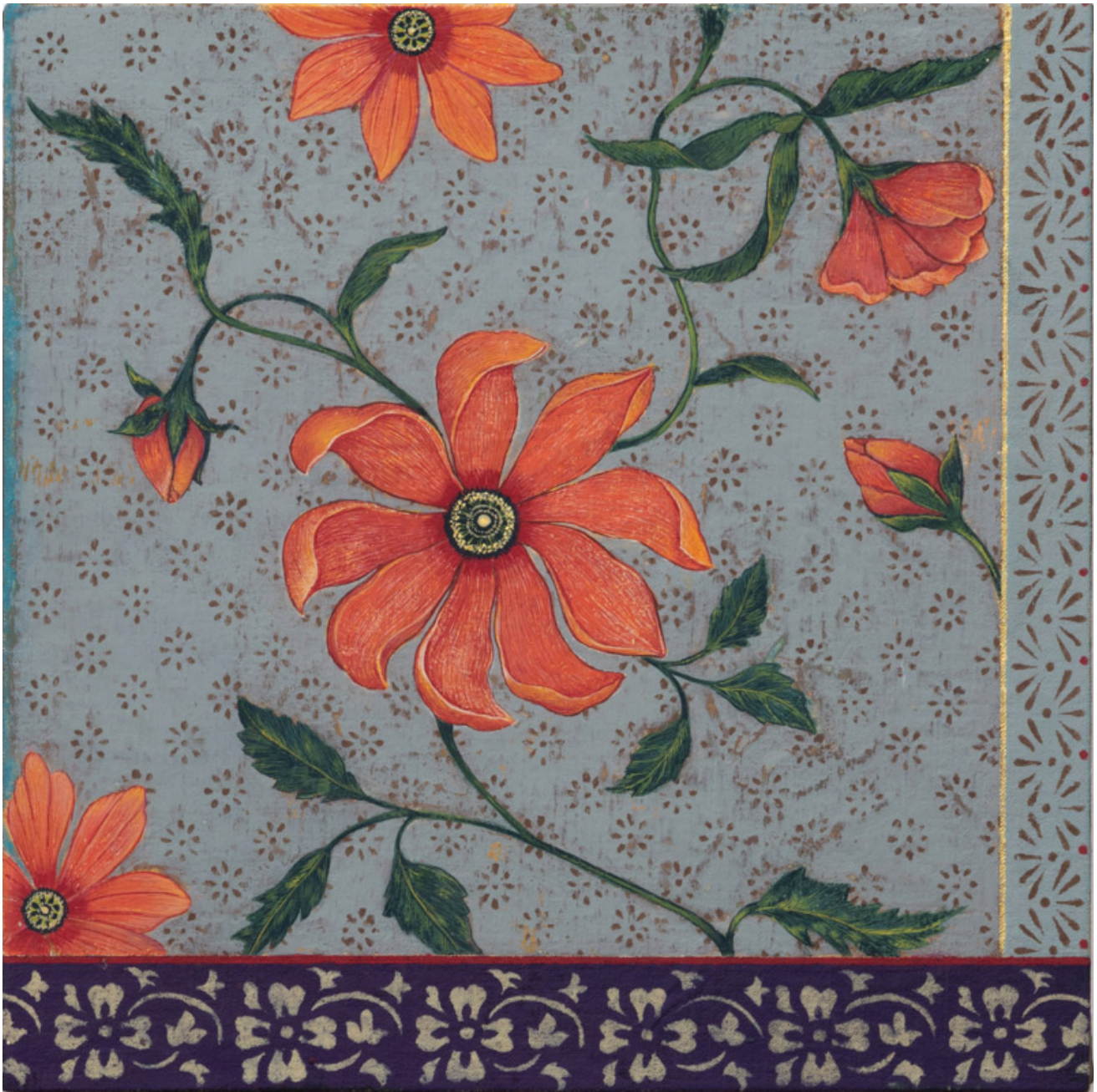
Antonia Munroe Festivities and Meditation: Two , 2022 gouache on linen on panel 12 x 12 inches $6,500