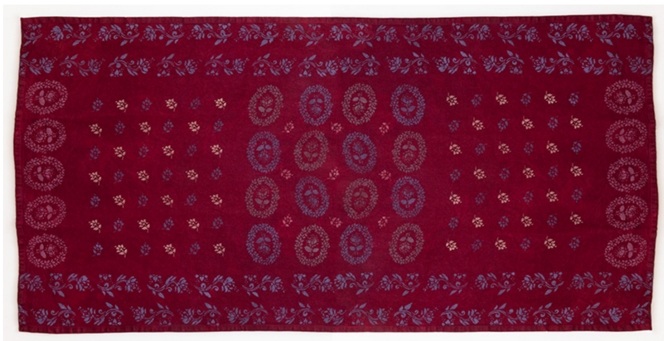
Antonia Munroe Carmine Tapestry , 2022 hand dyed and printed on linen 52 x 106 inches $2,500