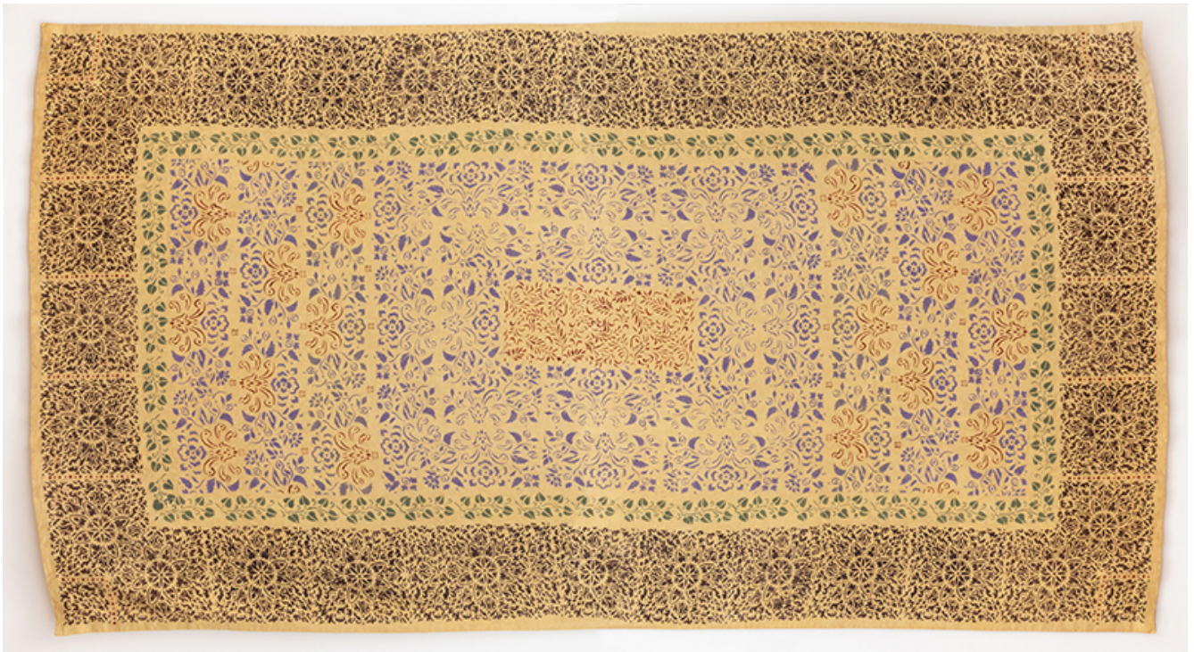
Antonia Munroe Myrobalan Tapestry I , 2022 hand dyed and printed on linen 62 x 114 inches $3,000