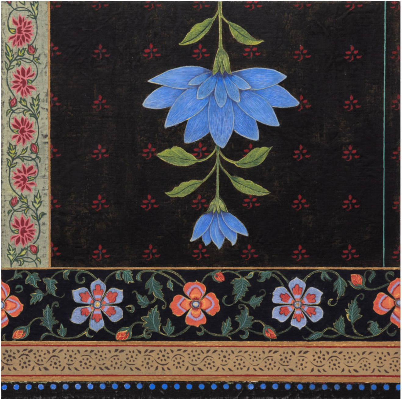
Antonia Munroe Blooming At Night , 2022 gouache on linen on panel 16 1/4 x 16 1/4 inches $8,500