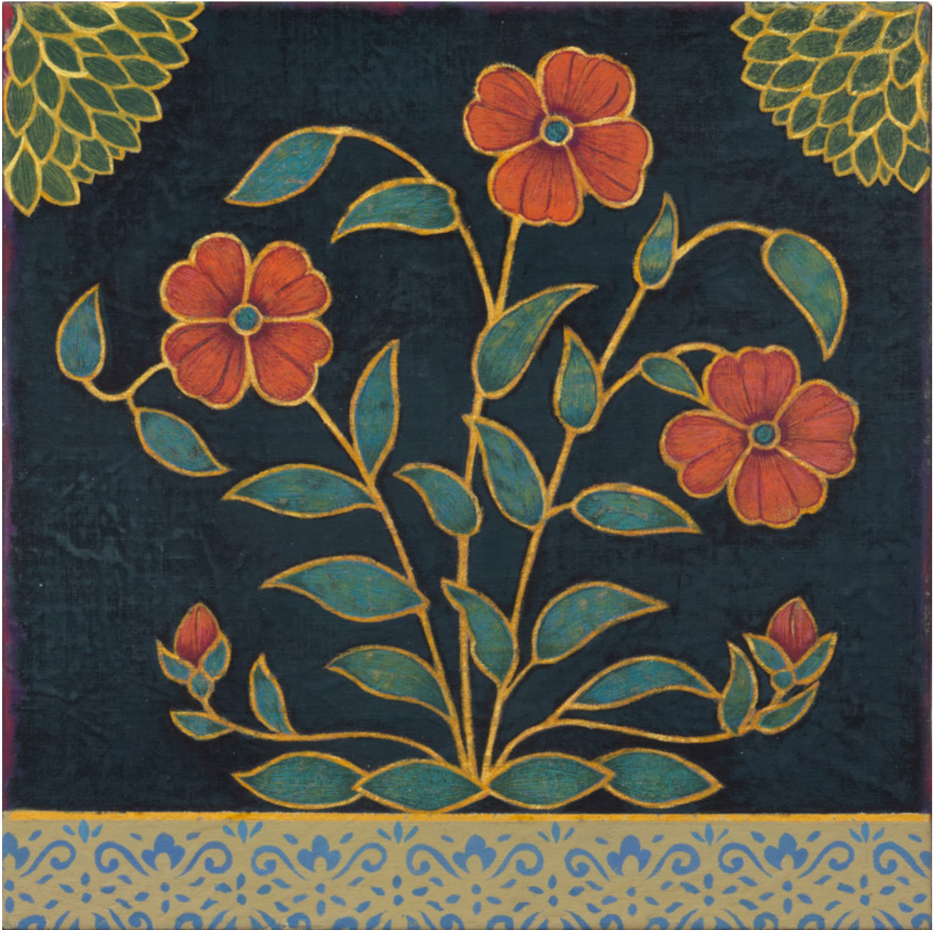
Antonia Munroe A Small Flowering Plant: blue leaves , 2022 gouache on linen on panel 12 x 12 inches $6,500