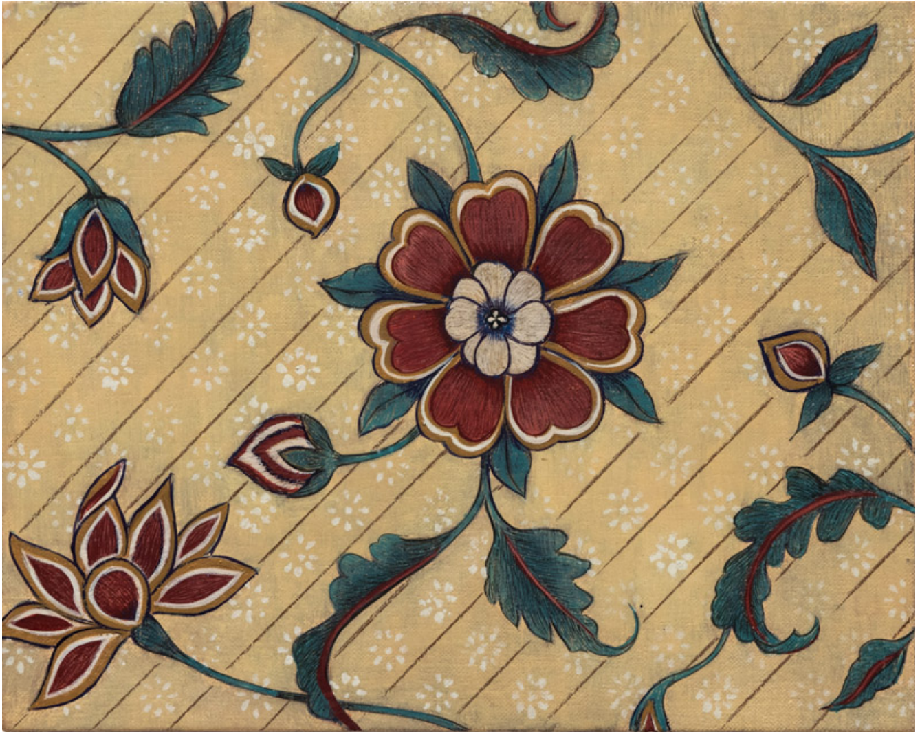
Antonia Munroe The Vine Bejeweled , 2021 gouache on linen on panel 8 x 10 inches $4,500