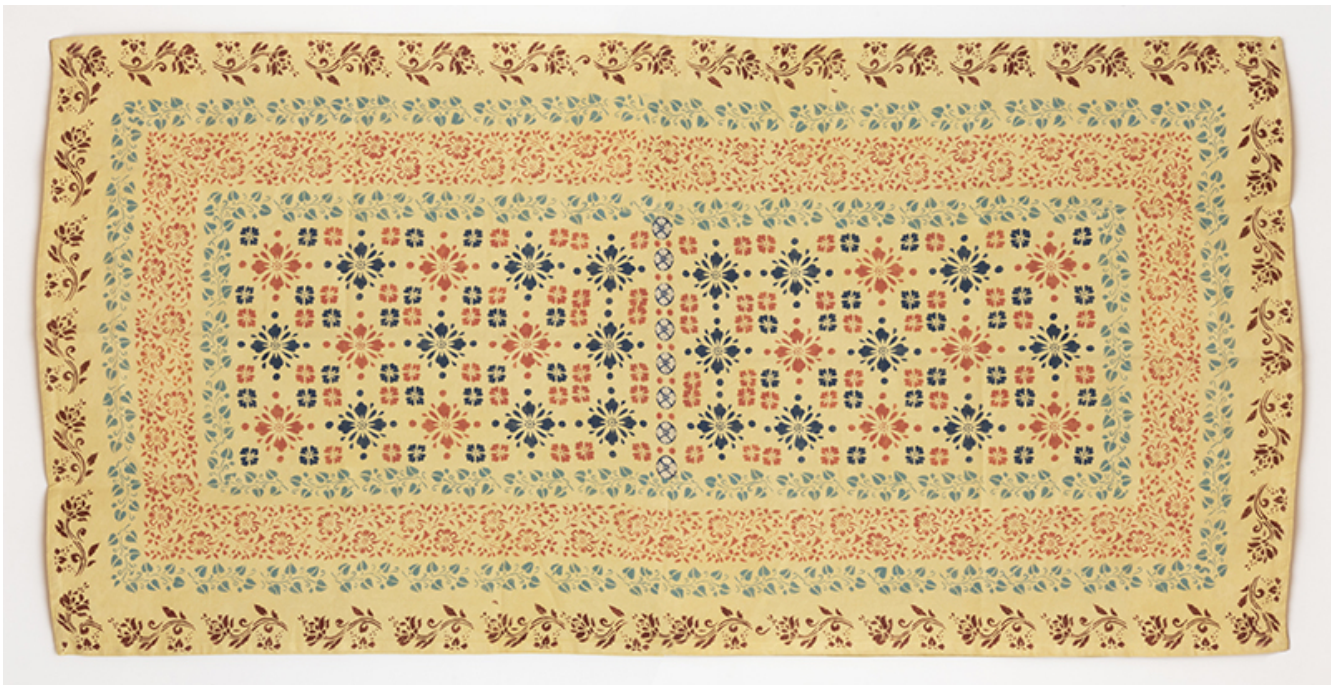
Antonia Munroe Myrobalan Tapestry II , 2022 hand dyed and printed on linen 53 x 106 inches SOLD