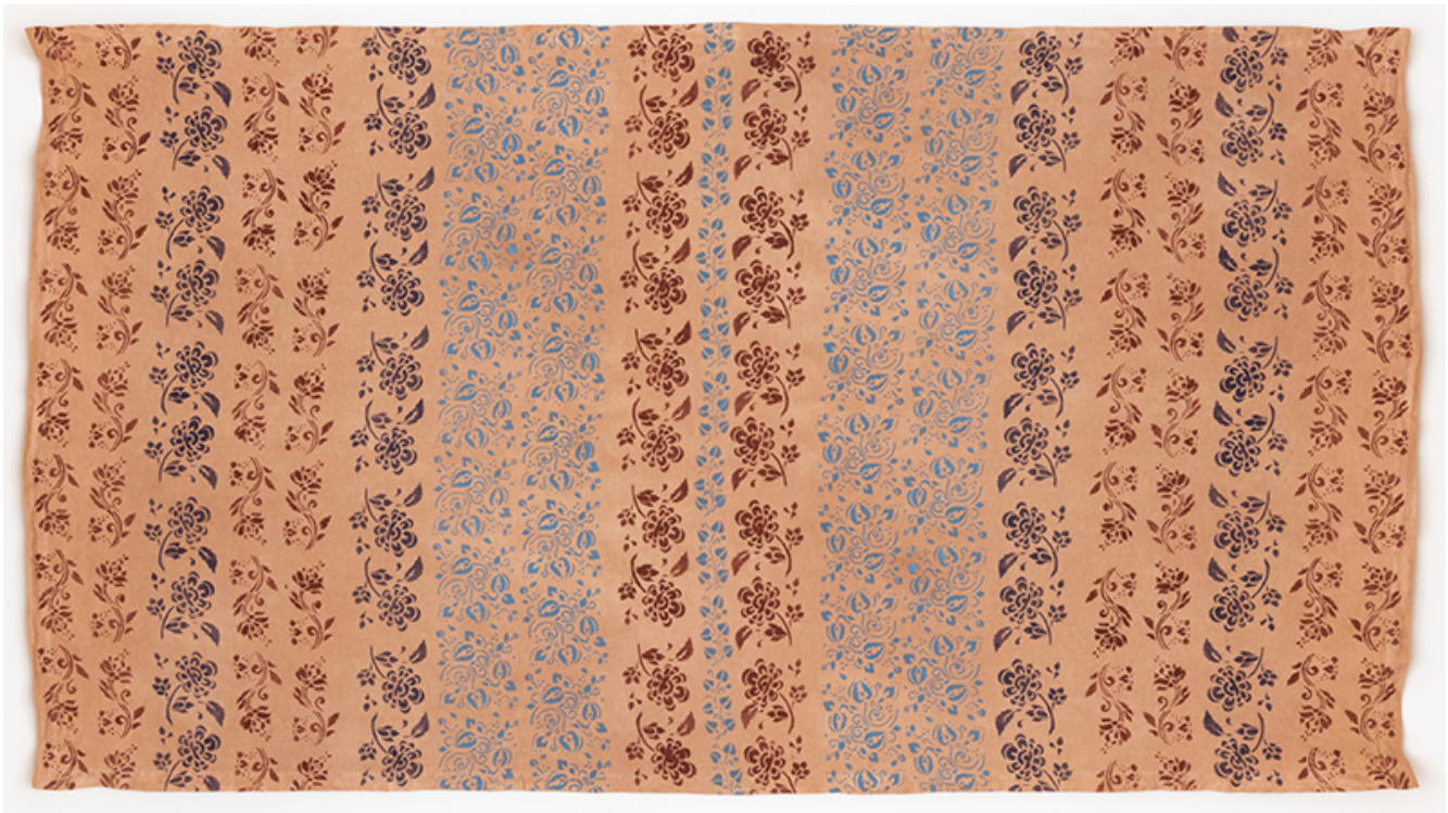
Antonia Munroe Lac Tapestry I , 2022 hand dyed and printed on linen 62 x 112 inches $3,000