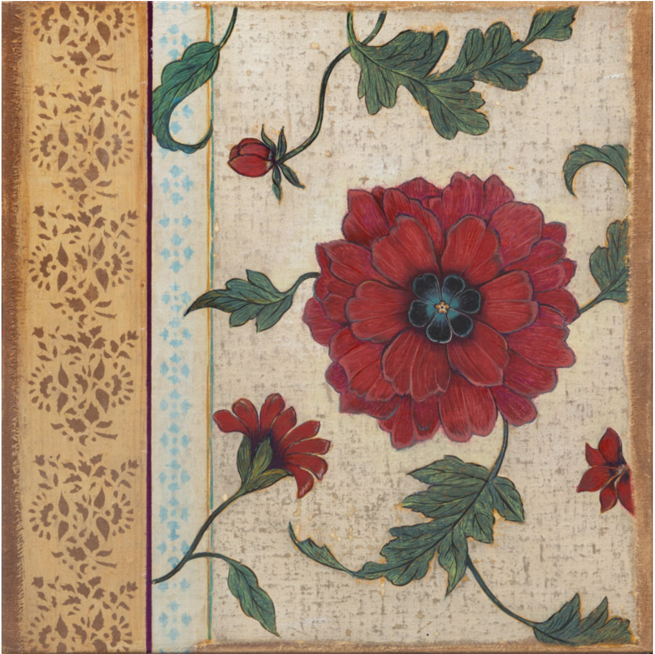
Antonia Munroe Festivities and Meditation: One , 2022 gouache on linen on panel 12 x 12 inches SOLD