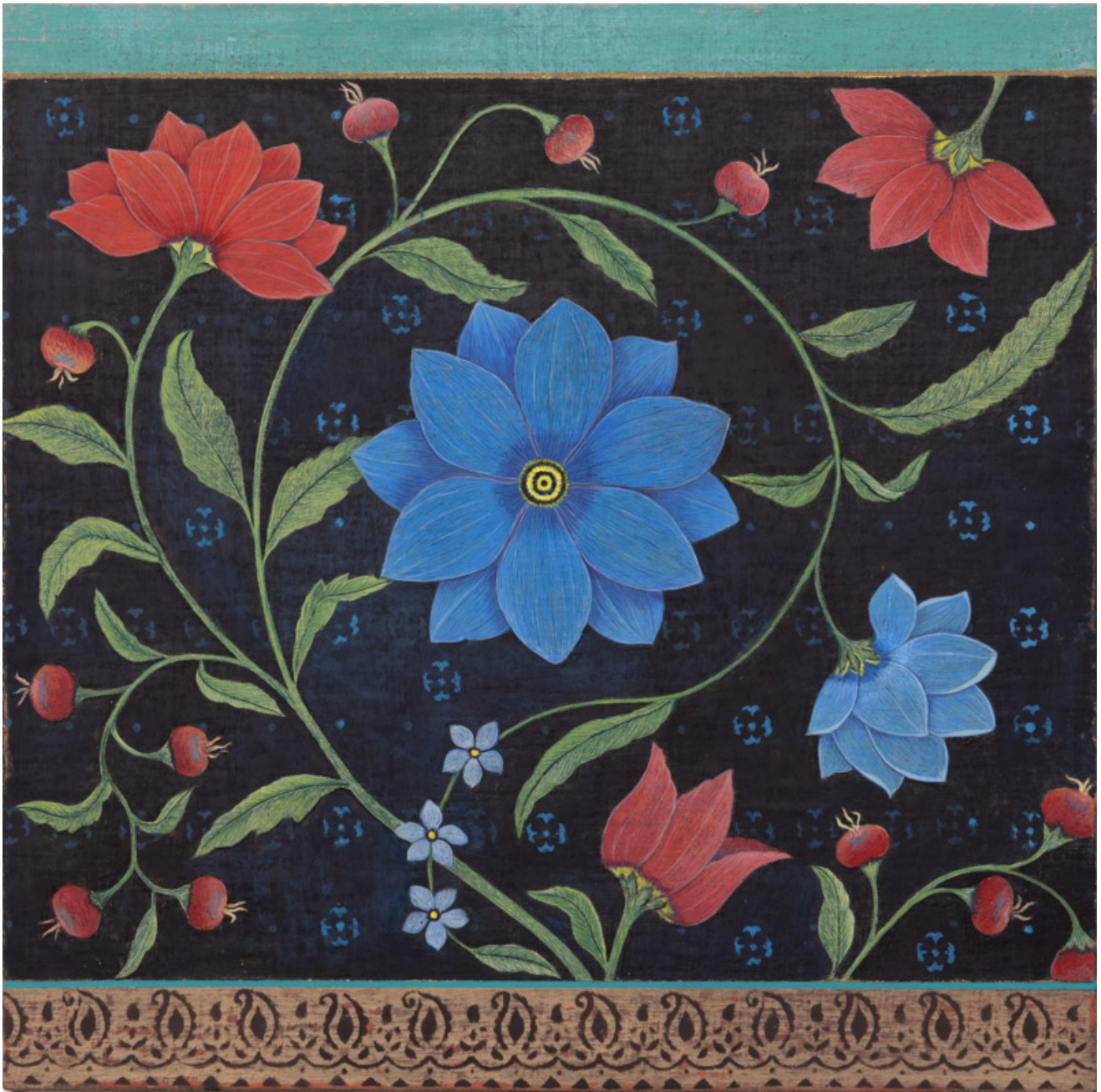
Antonia Munroe Floating in Exquisite Rhythm , 2022 gouache on linen on panel 16 1/4 x 16 1/4 inches $8,500