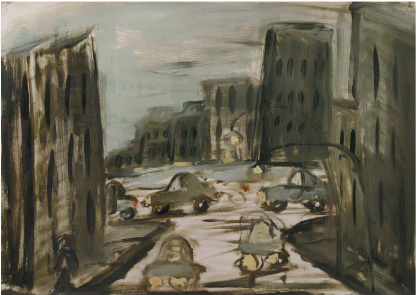
Daytime on Watts Street, 2003, oil on paper, 29 1/2 x 44 1/2"