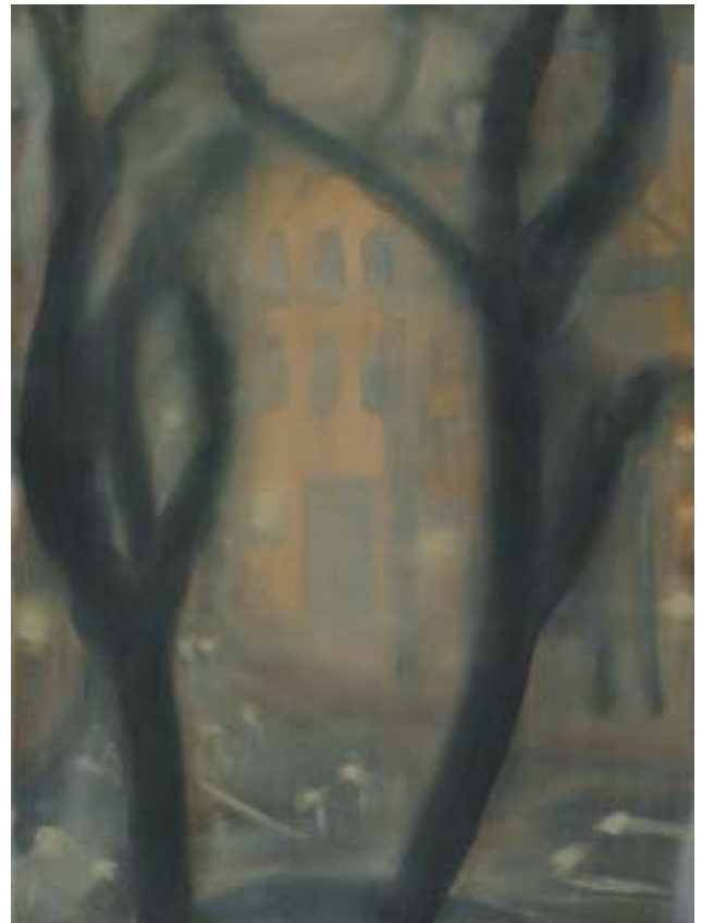
View from Studio Window, 2004, oil on canvas, 30 x 22"