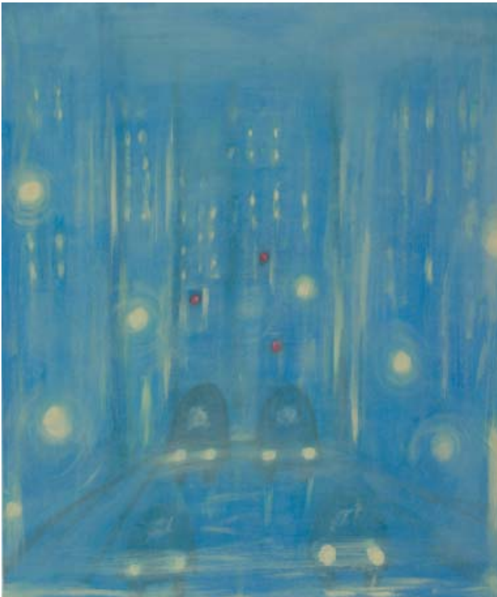
Heading South in Blue , 2003, oil on canvas, 36 x 30"