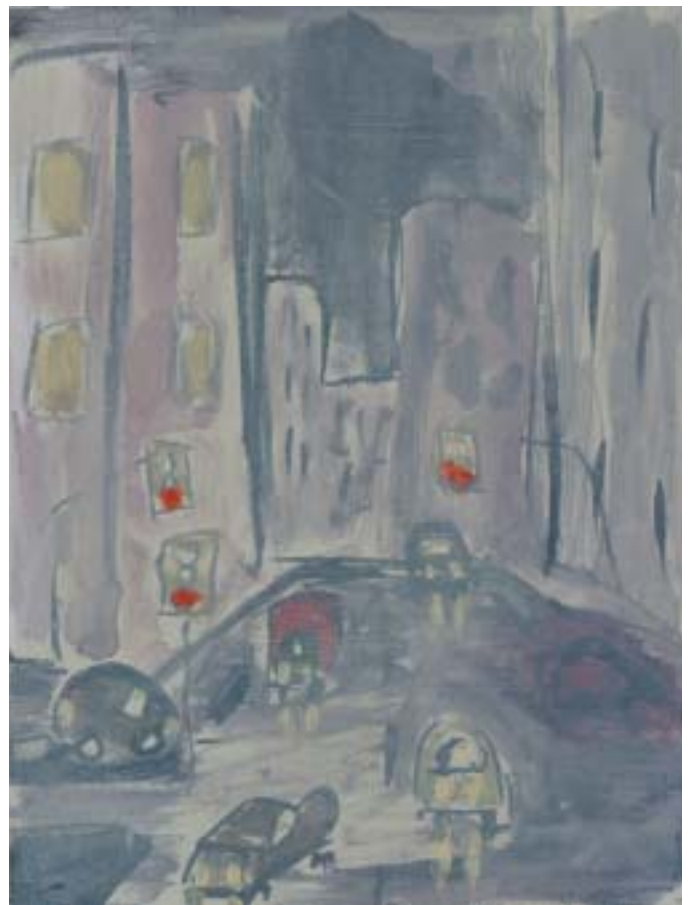
Traffic on Hudson , 2004, oil on canvas paper; 12 x 9"