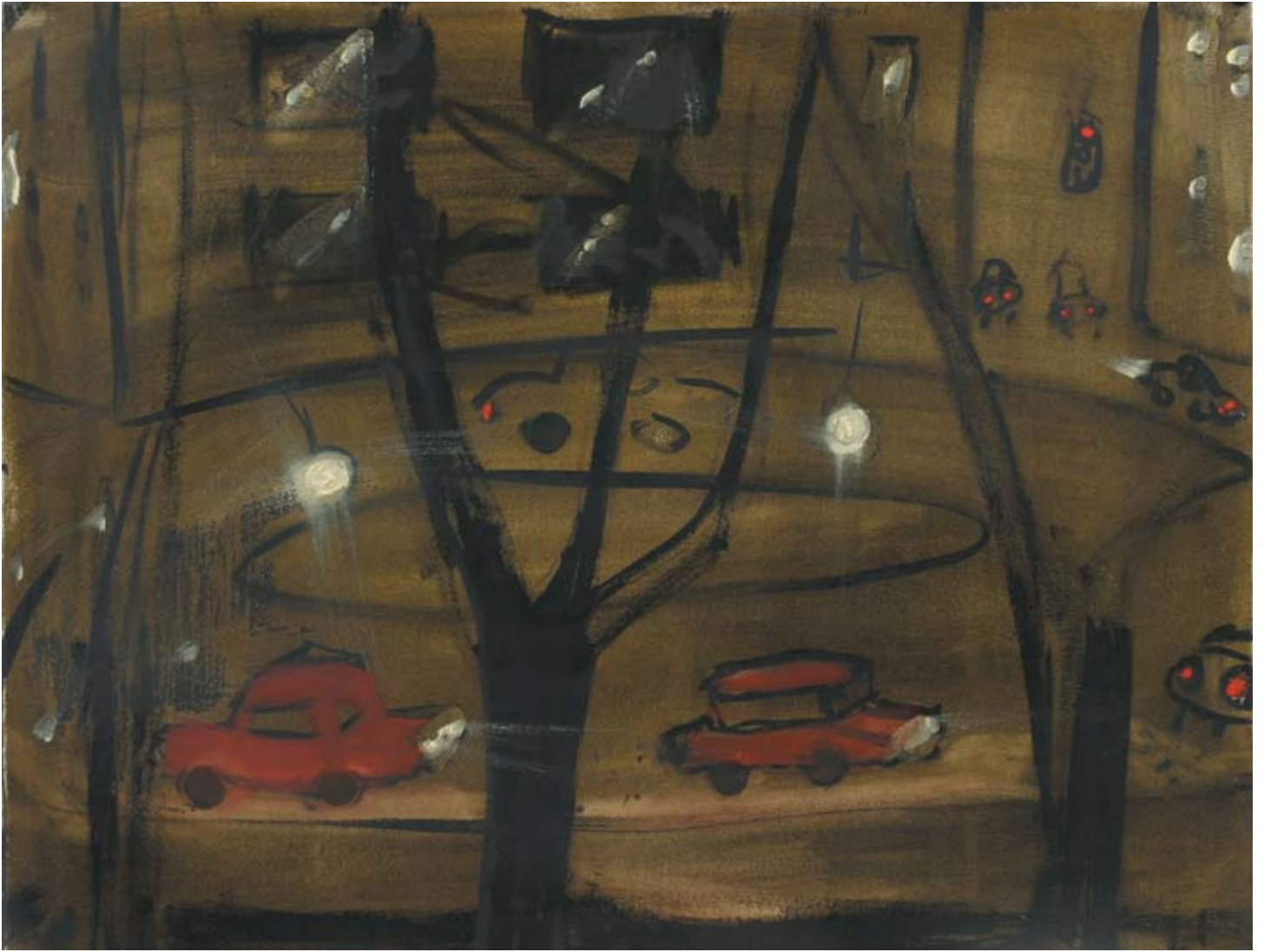
Circle Traffic in Brown , 2004, oil on paper; 20 x 26"