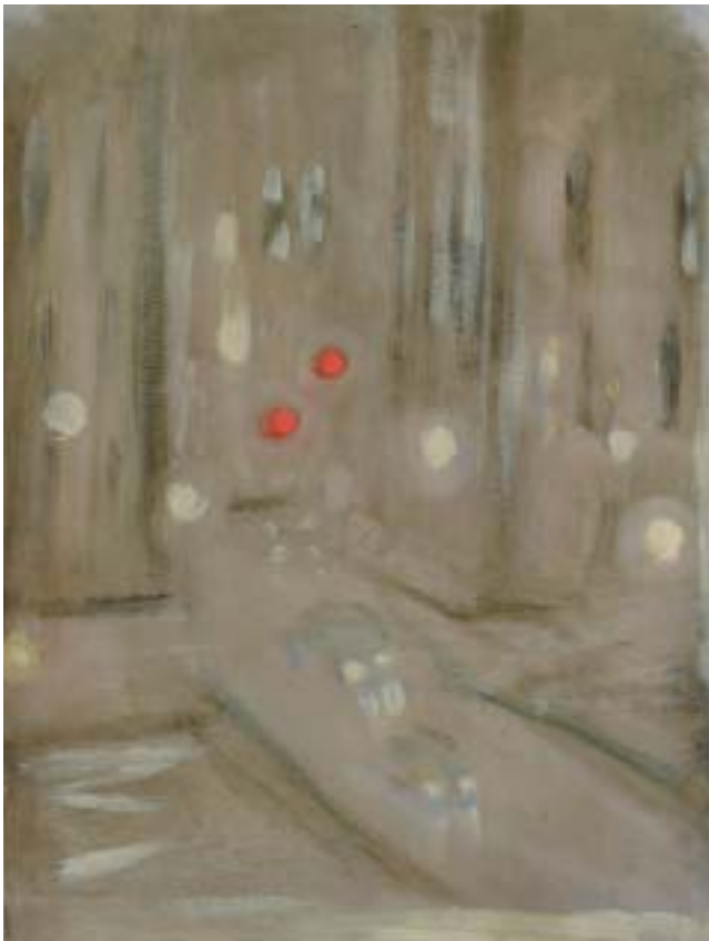
Traffic in Twilight, 2004, oil on paper, 12 x 9"